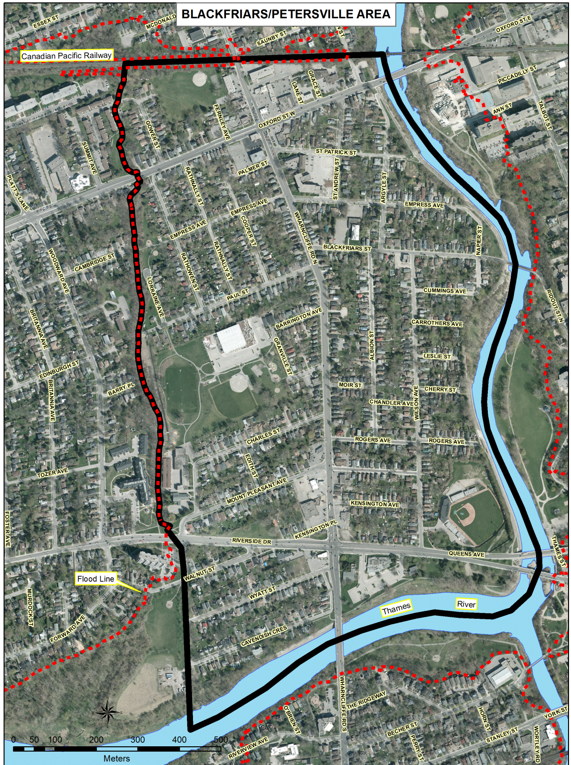
Figure 1 – Study Area