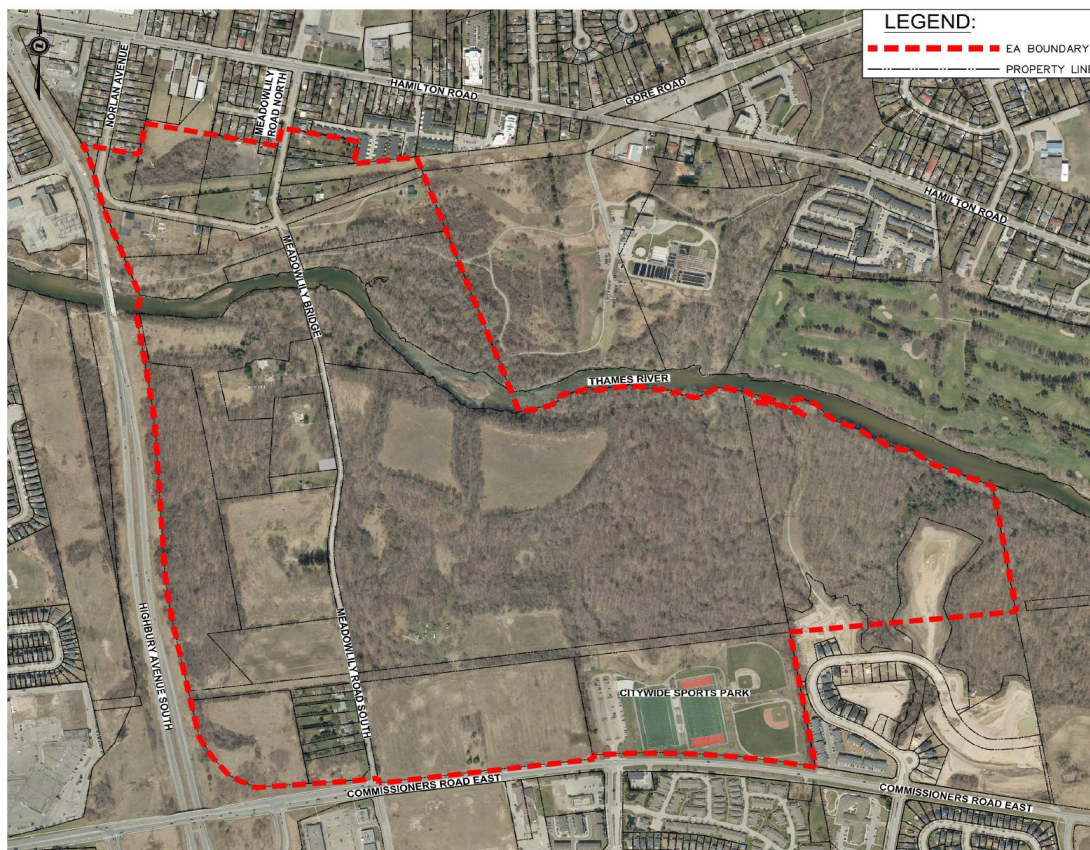
Figure 1: EA Study Area Map

The study area covers approximately 167 hectares (412 acres) of mixed-use land along both sides of the south branch of the Thames River, encompassing natural and cultural heritage areas, limited mid- to late-20th-century residential development, and key sites such as Meadowlily Woods ESA, Meadowlily Nature Preserve, and the Citywide Sports Park. The Meadowlily Road Area is generally bounded by Highbury Avenue South to the west, Commissioners Road East to the south, and Hamilton Road and the Thames River to the north, and includes portions of Meadowlily Road North and South, the Meadowlily Bridge, the Thames Valley Parkway, and the Citywide Sports Park. Significant natural features include the Meadowlily Woods ESA and the Thames River valley. The absence of municipal sanitary infrastructure has limited development potential in the area, while the lack of a continuous, safe active transportation facility along Meadowlily Road prevents full connectivity between the Thames Valley Parkway and Commissioners Road East.