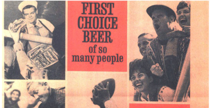
1950 Print advertisements for Labatt Pilsener and Labatt 50

A year later, Labatt launched its Pilsener Lager, setting the trend for lager beers in Canada. When it was introduced in Manitoba, the beer was nicknamed "Blue" for the colour of its label and the company's support of Winnipeg's Canadian Football League (CFL) franchise, the Blue Bombers. The nickname stuck and in 1979, Blue claimed the top spot in the Canadian beer market, a position it has held ever since.