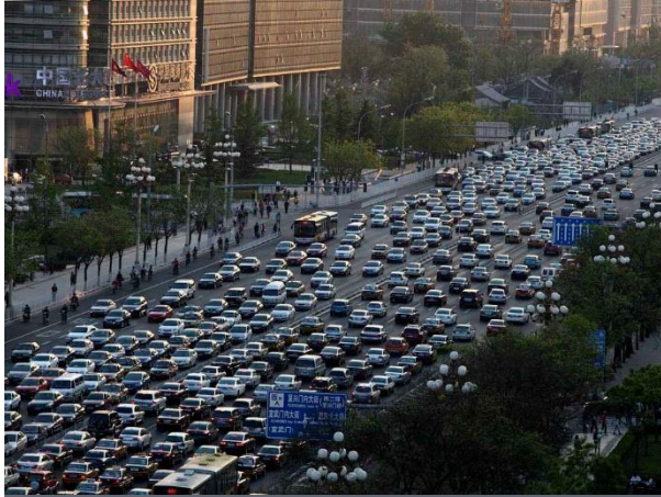
The case for a (mostly) car-free world canadiandimension.com

This is why we must not build bigger roads to encourage more driving. Please take a few minutes to educate yourself.