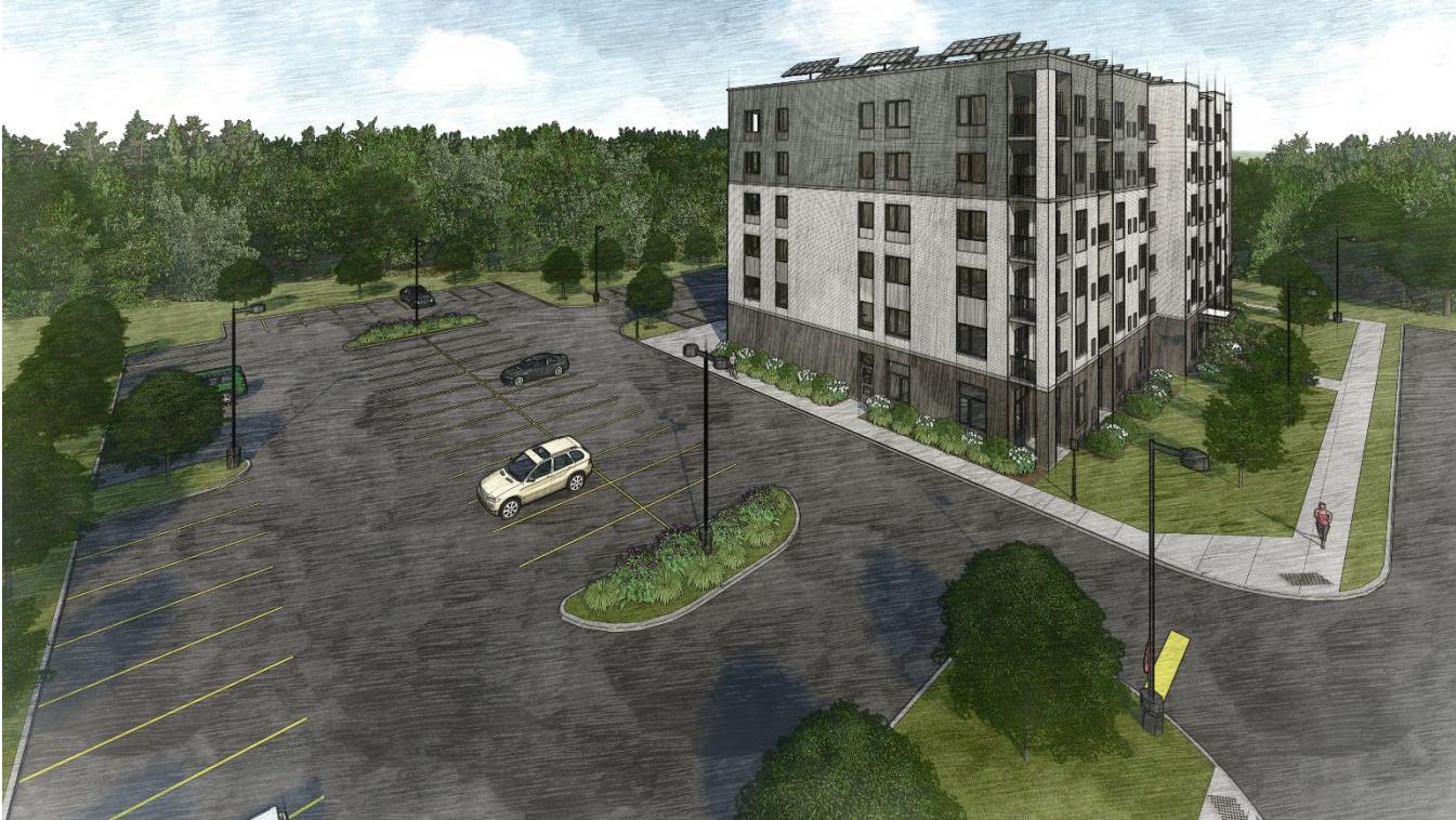
Original Conceptual Rendering (aerial view)