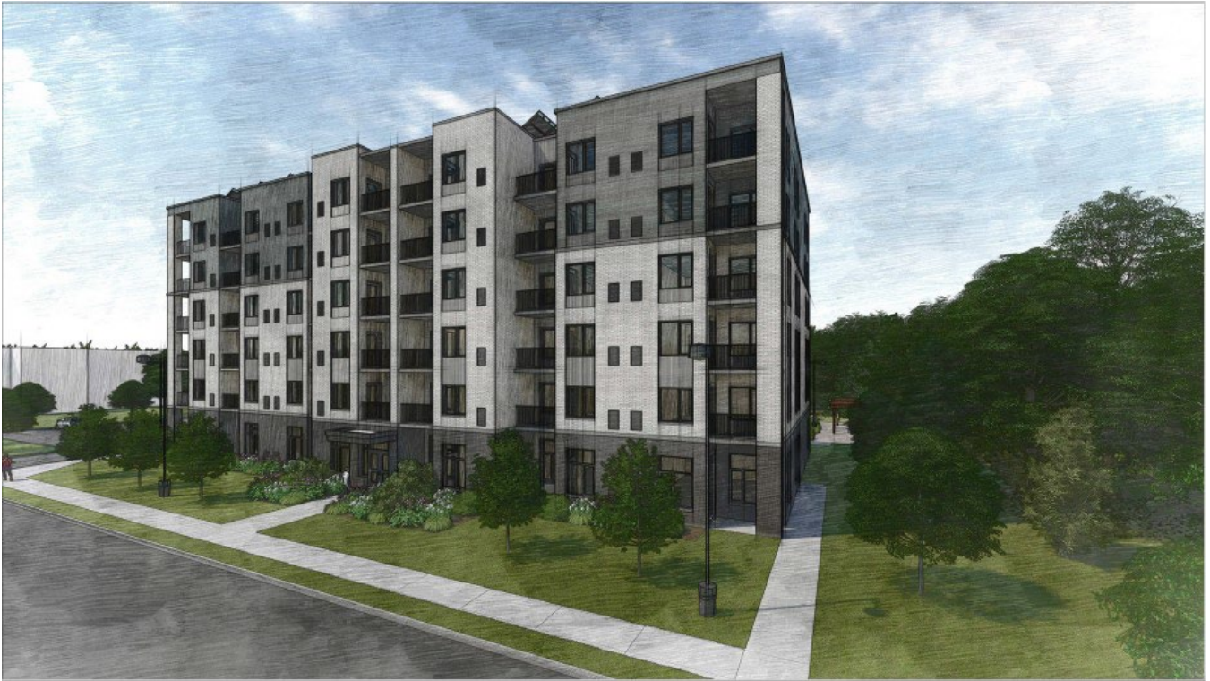
Original Conceptual Rendering (Front Corner)