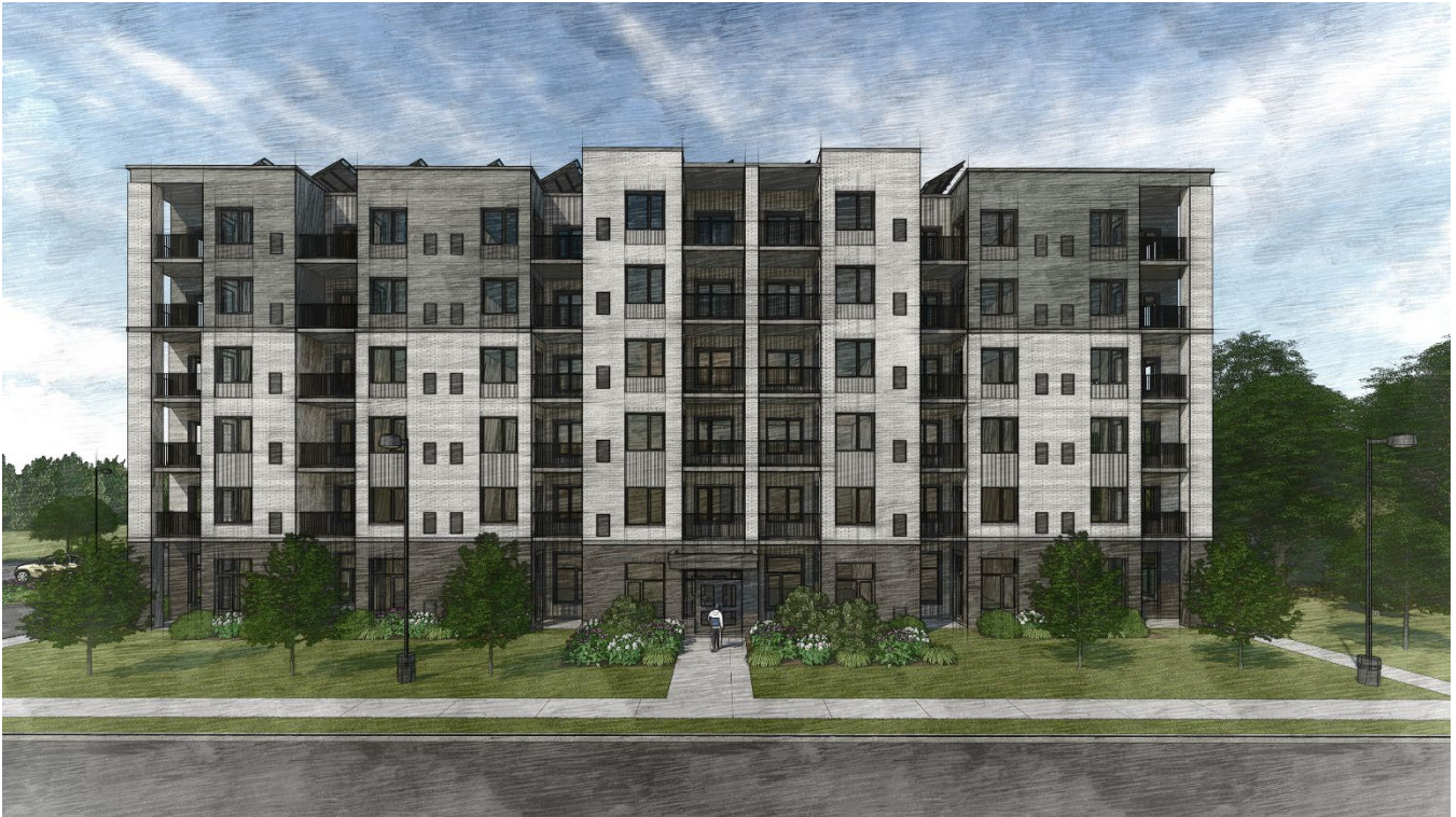
Conceptual Rendering (front

The above images represent the applicant's proposal as submitted and may change.