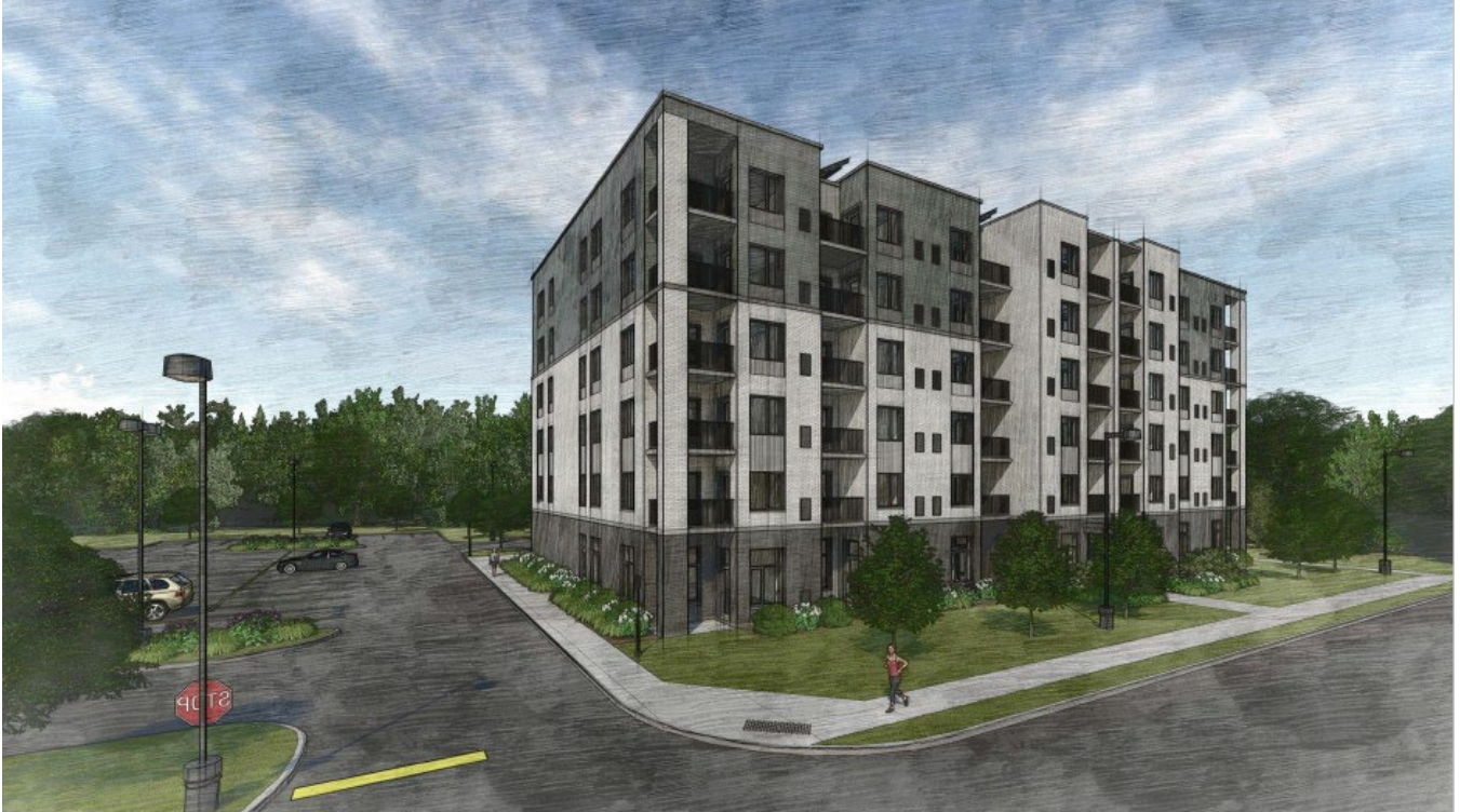
Original Conceptual Rendering (front driveway)