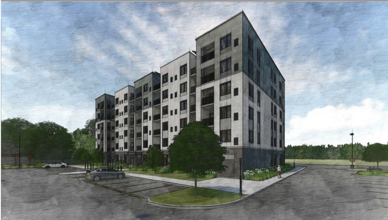
Original Conceptual Rendering (back corner)