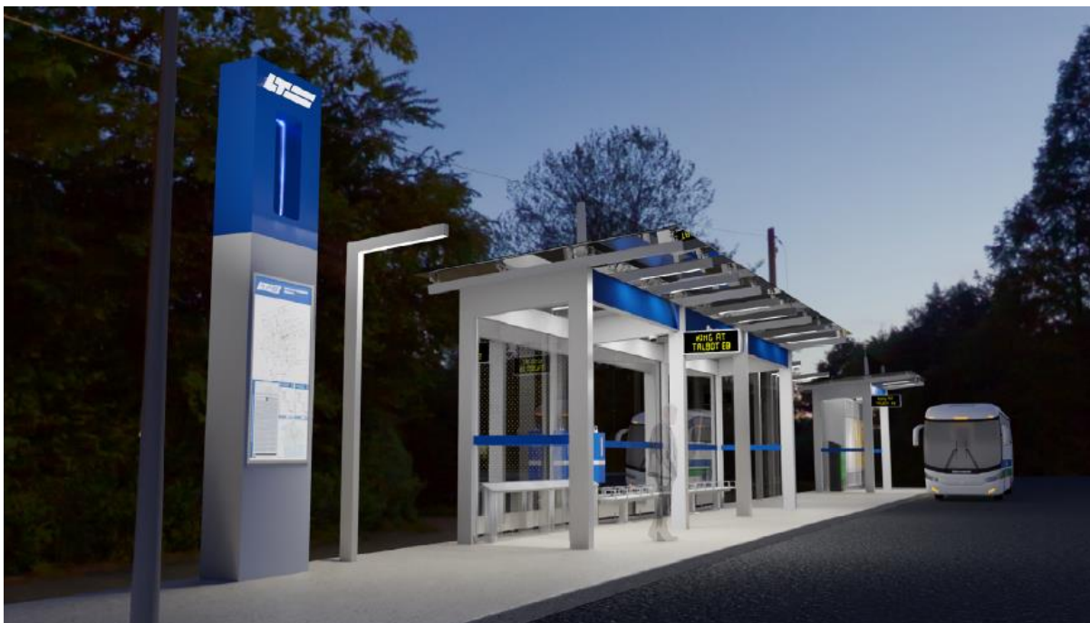
Figure 5: Rapid Transit Station Rendering

Figure 5 provides a rendering of a typical rapid transit station. The rapid transit program reached an exciting milestone in April with the installation of the first prototype shelter at King Street and Ontario Street. This first shelter has allowed the project team to test out some elements and fine-tune final details ahead of installing additional shelters in the core later this year.