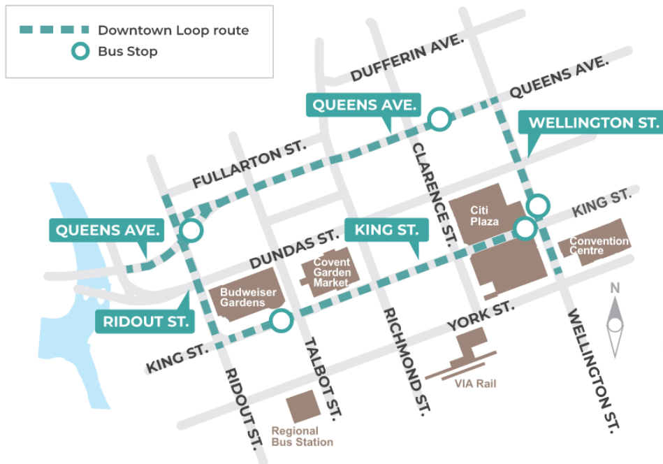
Figure 1: Limits of Downtown Loop