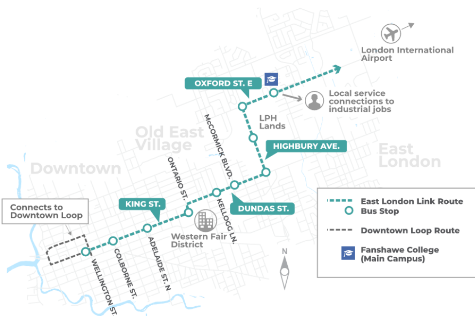
Figure 2: Limits of East London Link

The East London Link is a mixed-use corridor with existing land uses that include historic businesses, residential neighbourhoods, a growing entertainment district, and heavy industry. The corridor is anchored by Downtown London at the western end and Fanshawe College at the eastern end, serving the Western Fairgrounds, Old East Village, 100 Kellogg Lane, the Stackhouse District, future development at the former McCormick and London Psychiatric Hospital lands, and Fanshawe College’s main campus. The East London Link will add curbside rapid transit stations along King Street East and Dundas Street East and median rapid transit stations on Highbury Avenue North and at the Oxford Street intersection. A terminal station will be constructed on the Fanshawe College property. Figure 2 illustrates the East London Link corridor and indicates the approximate location of the rapid transit stations.