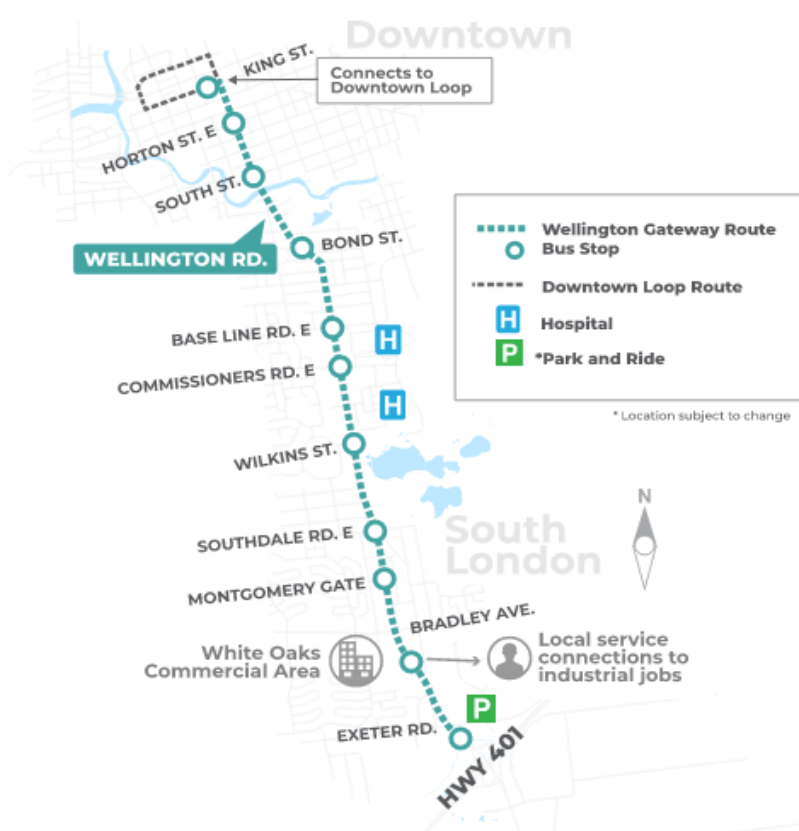
Figure 3: Limits of Wellington Gateway

The Wellington Gateway is a mixed-use corridor with existing land uses including historic sites, residential neighborhoods, medical facilities, and large-scale commercial sites. It progresses south from Downtown London along Wellington Street, which transitions into Wellington Road when it crosses the south branch of the Thames River. The corridor provides a thoroughfare for traffic between London's Downtown and Highway 401 and today supports several local transit routes. This corridor primarily includes median stations along Wellington Street and Road, including a turn around and/or Park-n-Ride facility near Exeter Road. Figure 3 illustrates the Wellington Gateway corridor and indicates the approximate location of rapid transit stations.