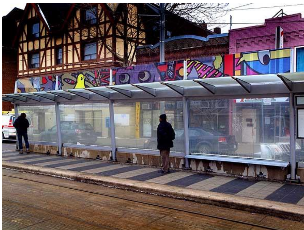
Figure 6: St. Clair Station

In seeking to enhance our transit stops with public art, the project team looked to other municipalities for inspiration on innovative approaches and best practices. An example of this can be seen in Figure 6, which highlights the Toronto Transit Commission's St. Clair station stop. This station effectively incorporates public art into its design, serving as a model for other cities.