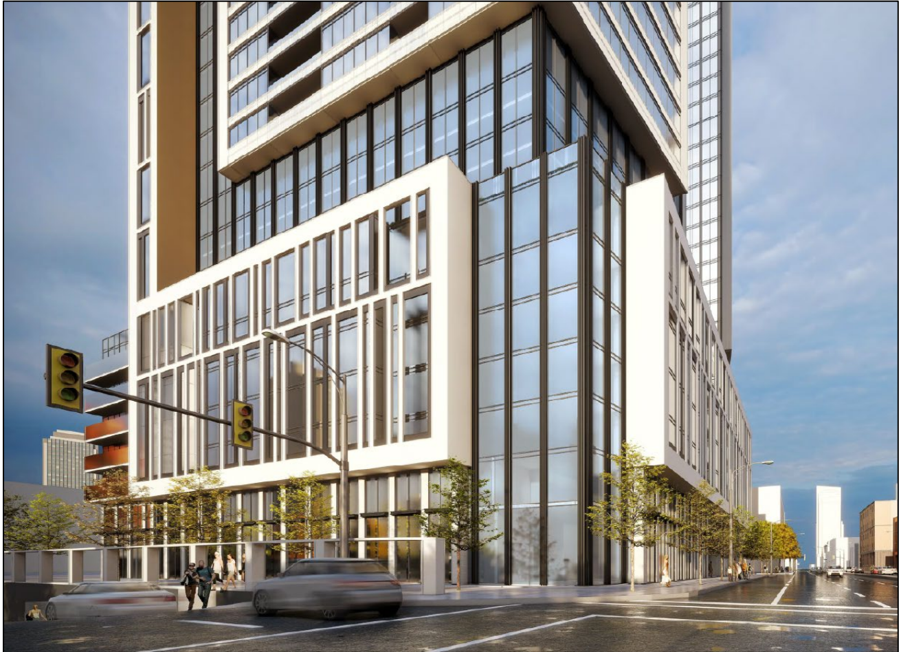
Southwesterly View (York Street and Wellington Street Intersection)

The above images represent the applicant's proposal as submitted and may change.