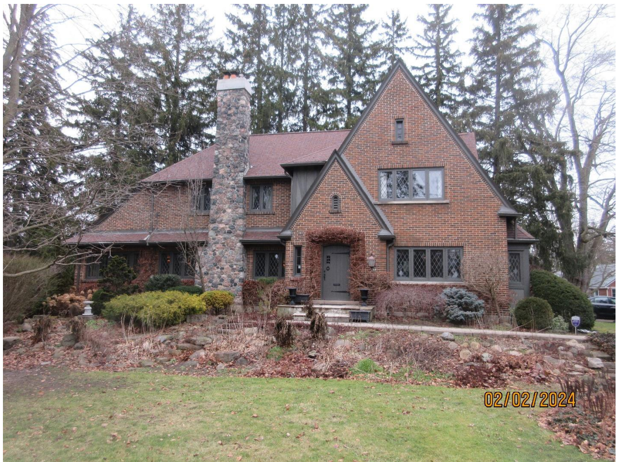
Image 2: View of the house at 244 Base Line Road East looking north from Base Line Road East.