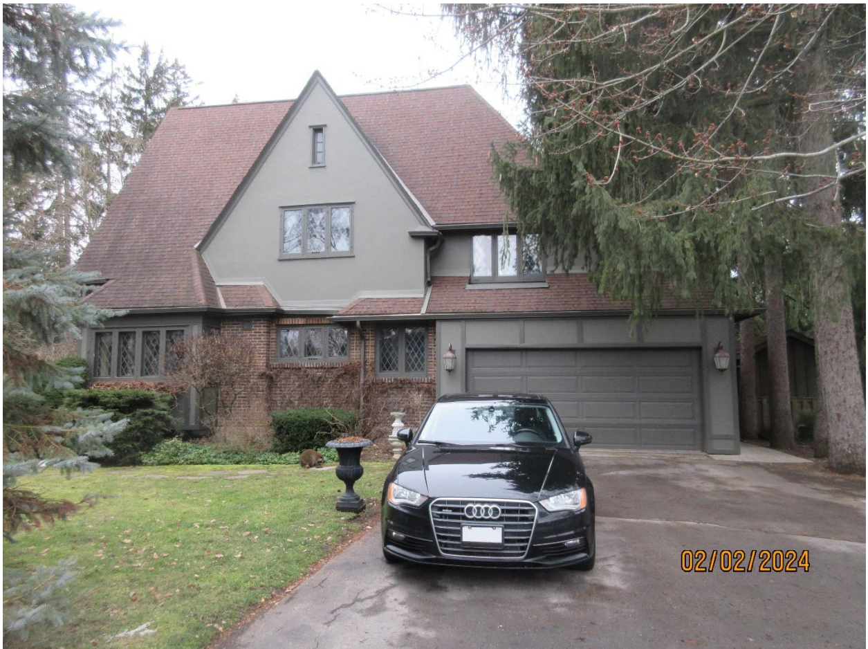
Image 6: View of the east facade of the house at 244 Base Line Road East, as seen from Wortley Road.