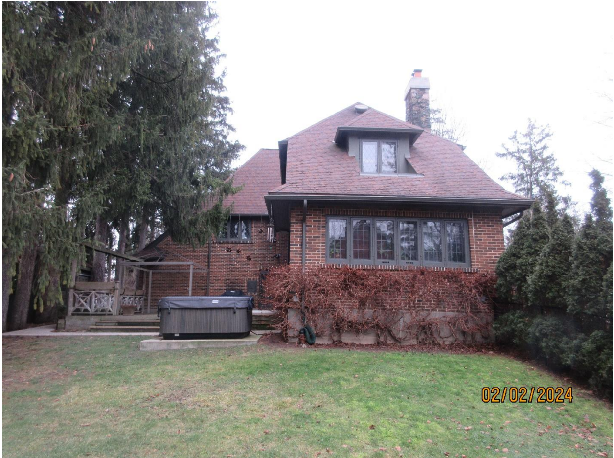
Image 5: View of the west façades of the house at 244 Base Line Road East, from the back yard of the property.