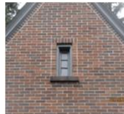
7. Three-lite windows in the east gable, south gable, and adjacent to the front doorway