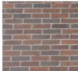
3. Use of reddish brown and brown rug brick exterior cladding, including masonry detailing