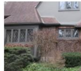
8. Oriel projection on the east façade with windows, supported by brackets and clad in paring or stucco half-timbering