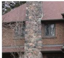
5. Large, tapered fieldstone chimney as a dominant feature on the south elevation