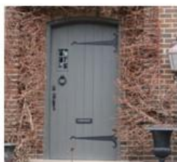
10. Painted wood front door with exposed, oversized hinge hardware, six-lite window, knocker, mail slot, and hardware