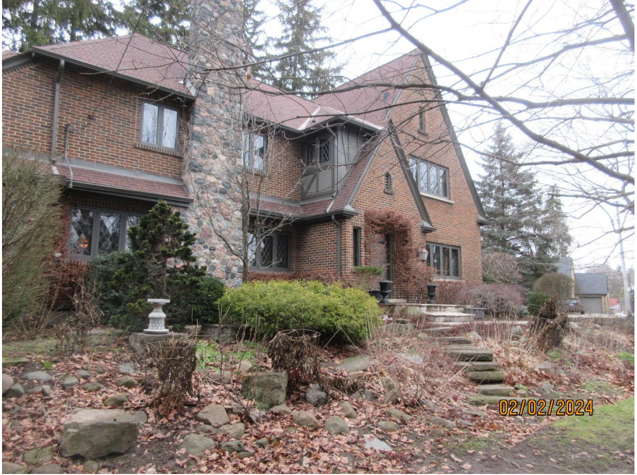
Image 4: View looking northeast towards the house at 244 Base Line Road East.