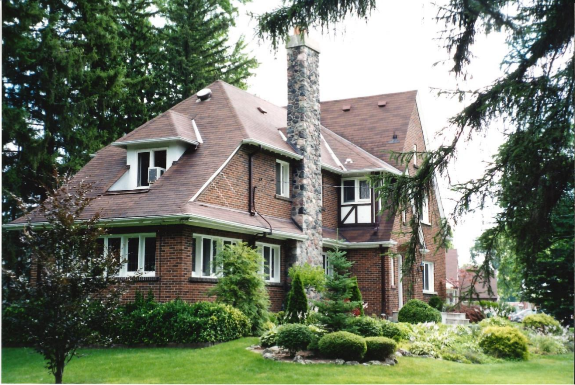
Image 1: Undated photograph of the property at 244 Base Line Road East, showing the view of the house looking northeast.