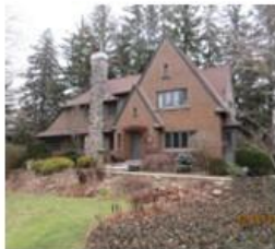
1. Asymmetrical massing, with frontispiece gable