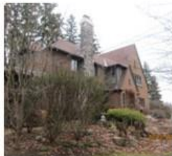
2. Complex roof shape, including steeply pitched gables