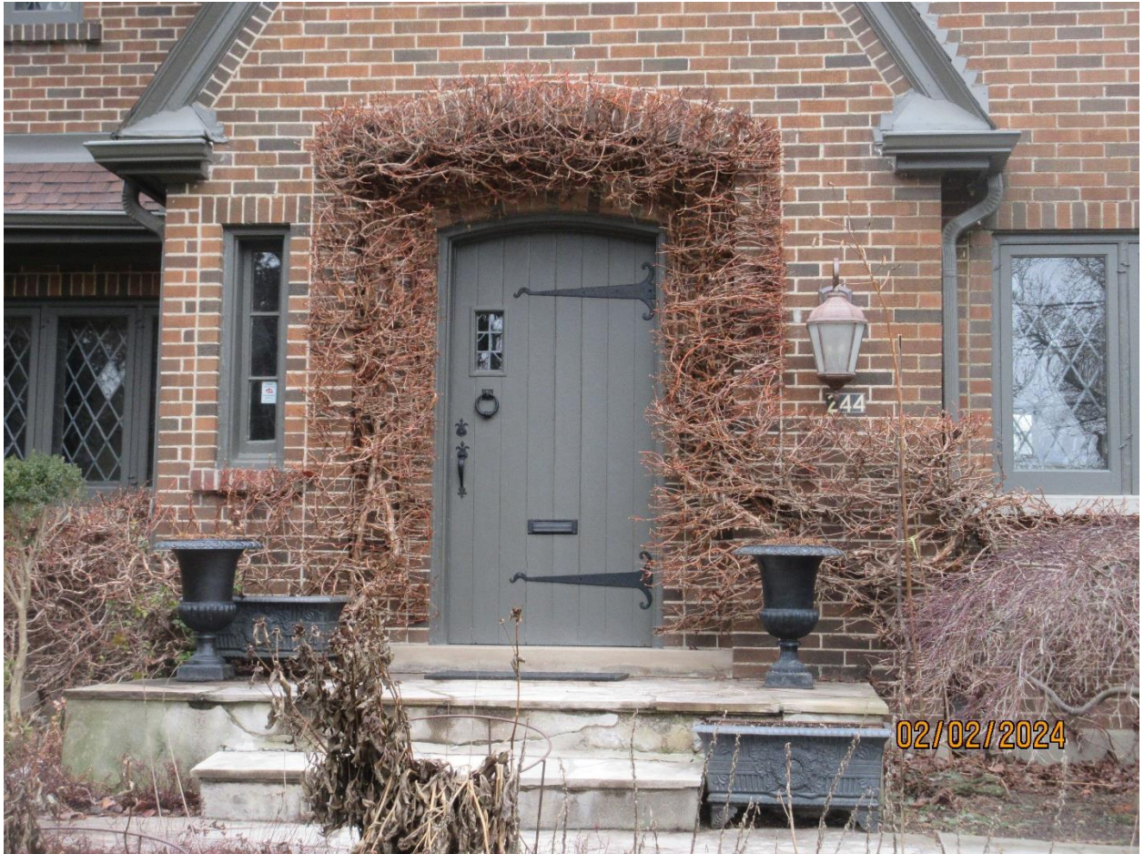
Image 3: Detail of the front doorway of the house at 244 Base Line Road East.