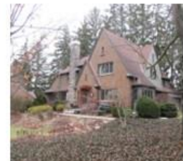
12. Unobstructed views to the south elevation and east elevation of the house from Base Line Road East and Wortley Road.

Note: Not every heritage attribute indicated above; image is considered indicative of heritage attributes