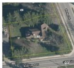
11. Location on the northwest corner of Base Line Road East and Wortley Road