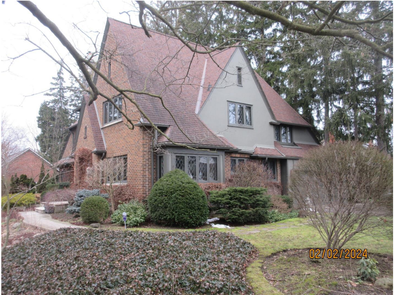
Image 7: View of the south (left) and east (right) facades of the house at 244 Base Line Road East.