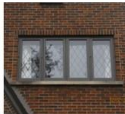
6. Diamond or quarry-leaded casement windows