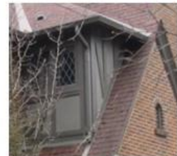
4. Secondary use of paring or stucco finish, including half-timbering, exterior cladding detailing