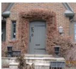
9. Recessed front doorway on the south elevation