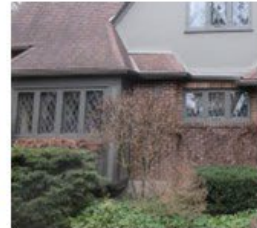
8. Oriel projection on the east façade with windows, supported by brackets and clad in paring or stucco half-timbering