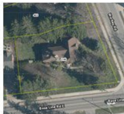
11. Location on the northwest corner of Base Line Road East and Wortley Road