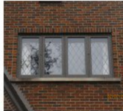
6. Diamond or quarry-lead casement windows