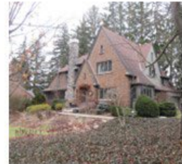
12. Unobstructed views to the south elevation and east elevation of the house from Base Line Road East and Wortley Road.

Note: Not every heritage attribute indicated above; image is considered indicative of heritage attributes