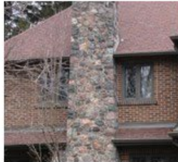
5. Large, tapered fieldstone chimney as a dominant feature on the south elevation