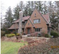
1. Asymmetrical massing, with frontispiece gable