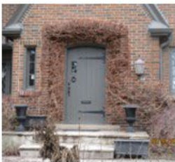
9. Recessed front doorway on the south elevation