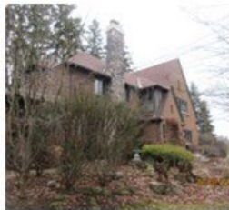
2. Complex roof shape, including steeply pitched gables