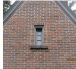
7. Three-lite windows in the east gable, south gable, and adjacent to the front doorway