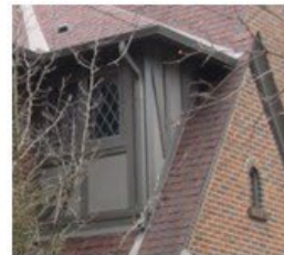
4. Secondary use of paring or stucco finish, including half-timbering, exterior cladding detailing