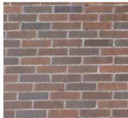
3. Use of reddish brown and brown rug brick exterior cladding, including masonry detailing