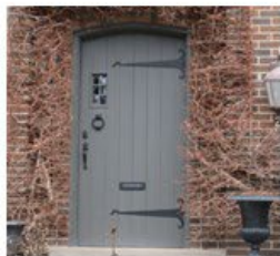
10. Painted wood front door with exposed, oversized hinge hardware, six-lite window, knocker, mail slot, and hardware