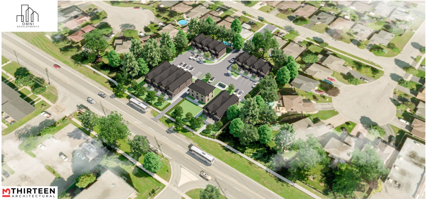
Figure 2: Aerial rendering of the proposed development.