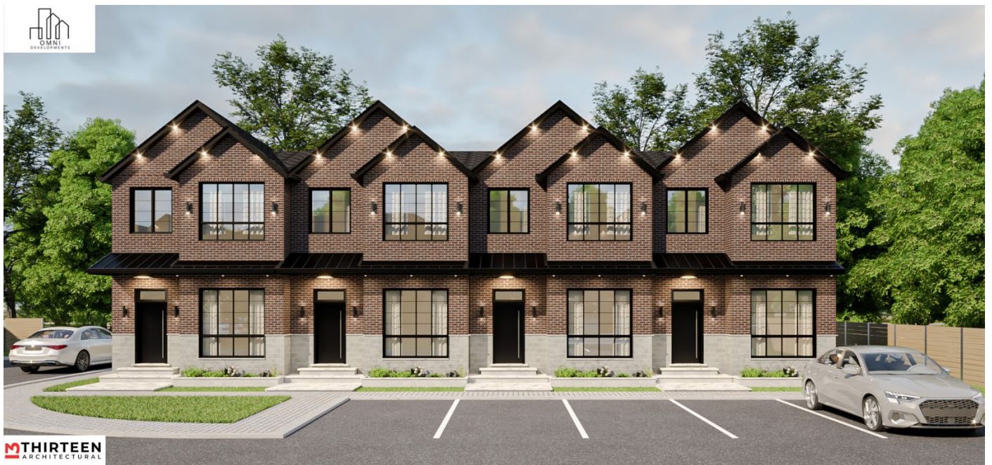
Figure 3: Front facing façade of the proposed townhouse building.

The above images represent the applicant's proposal as submitted and may change.