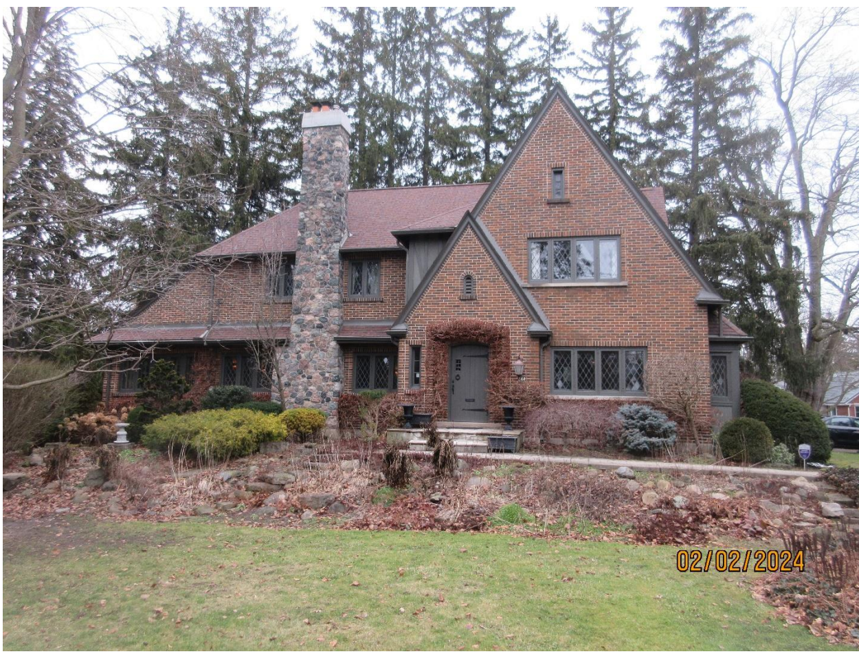
Image 2: View of the house at 244 Base Line Road East looking north from Base Line Road East.