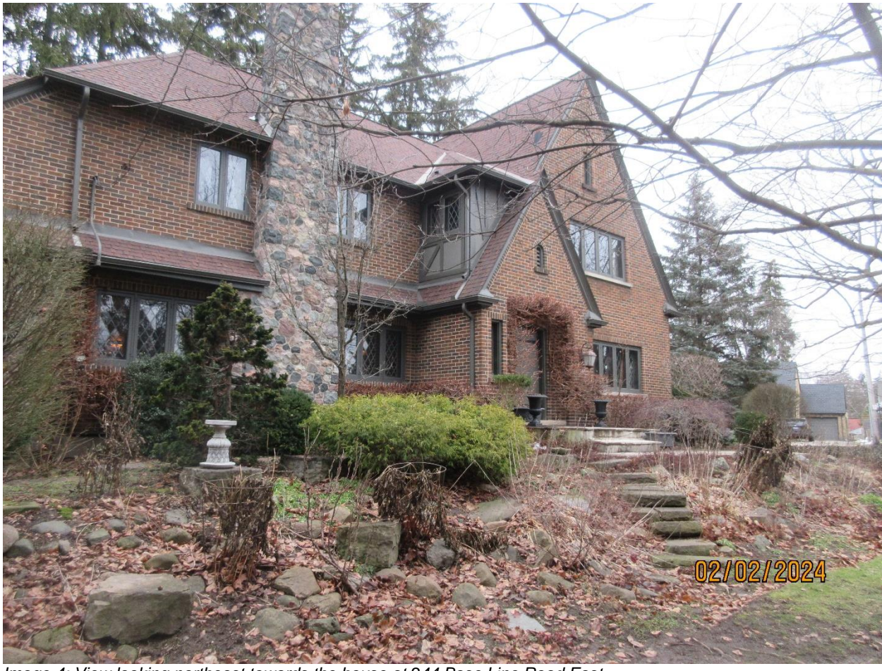
Image 4: View looking northeast towards the house at 244 Base Line Road East.