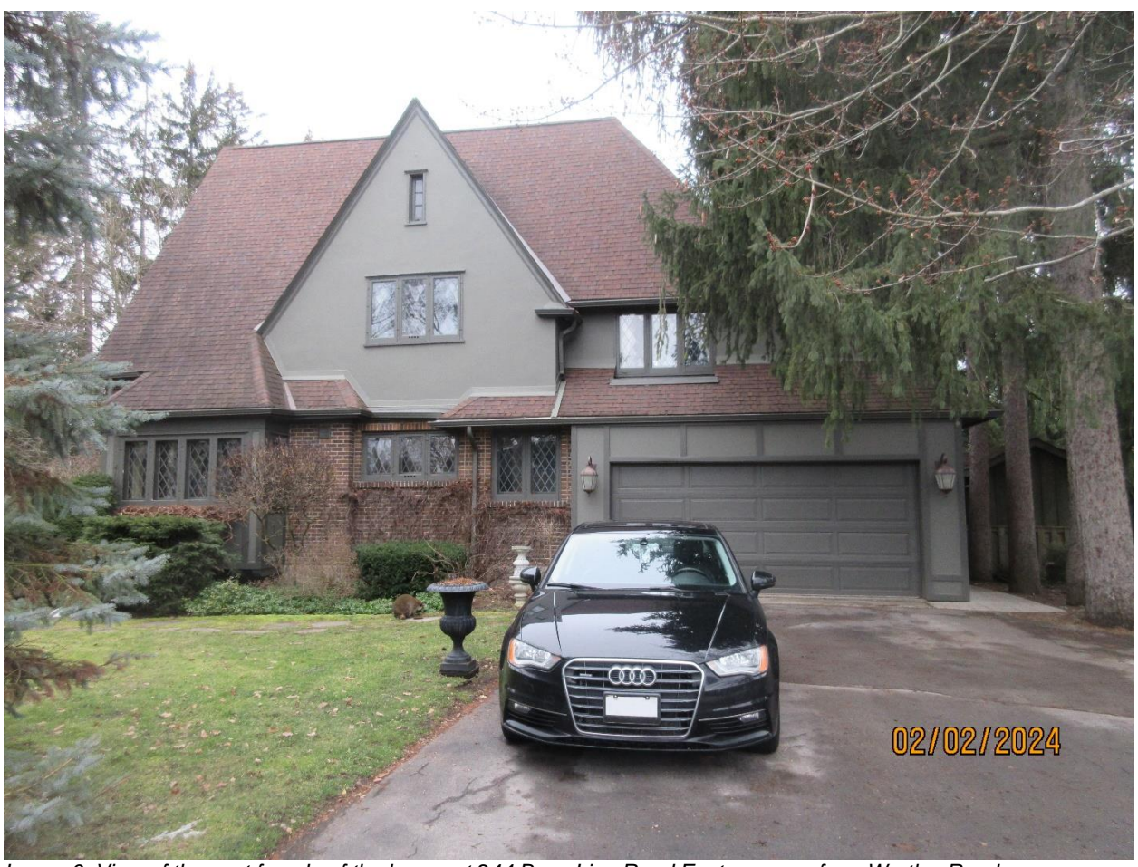
Image 6: View of the east facade of the house at 244 Base Line Road East, as seen from Wortley Road.