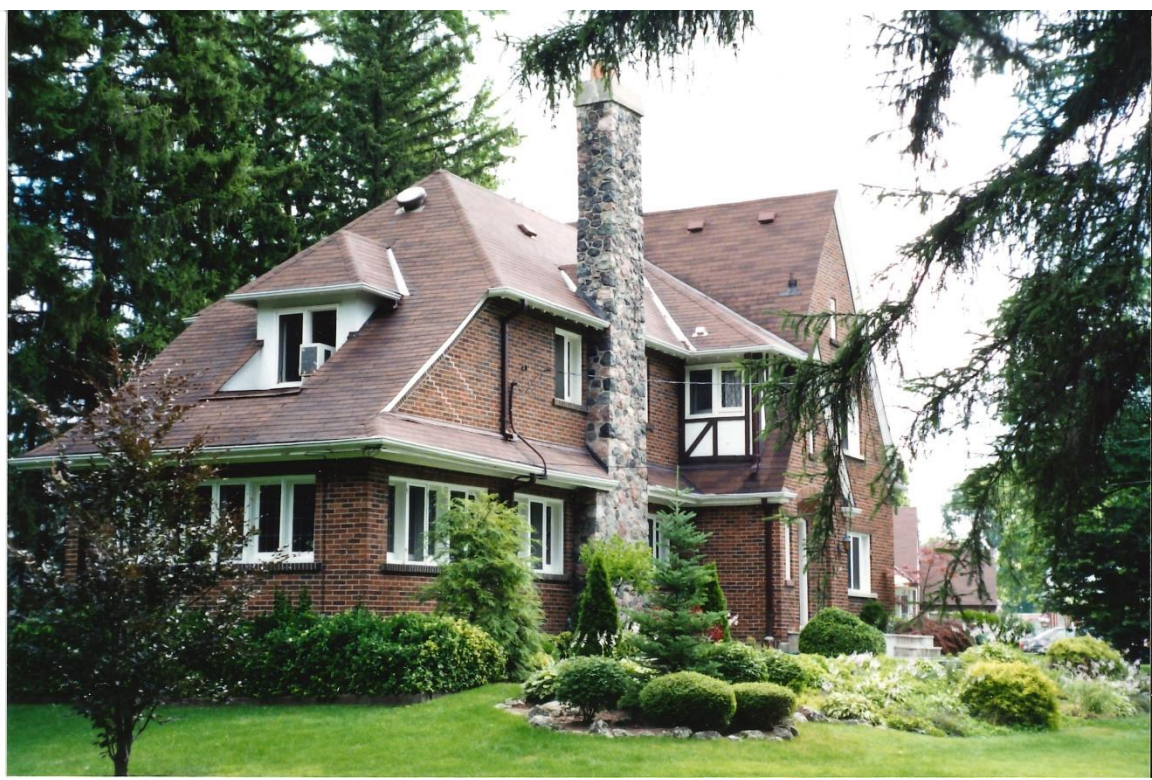
Image 1: Undated photograph of the property at 244 Base Line Road East, showing the view of the house looking northeast.