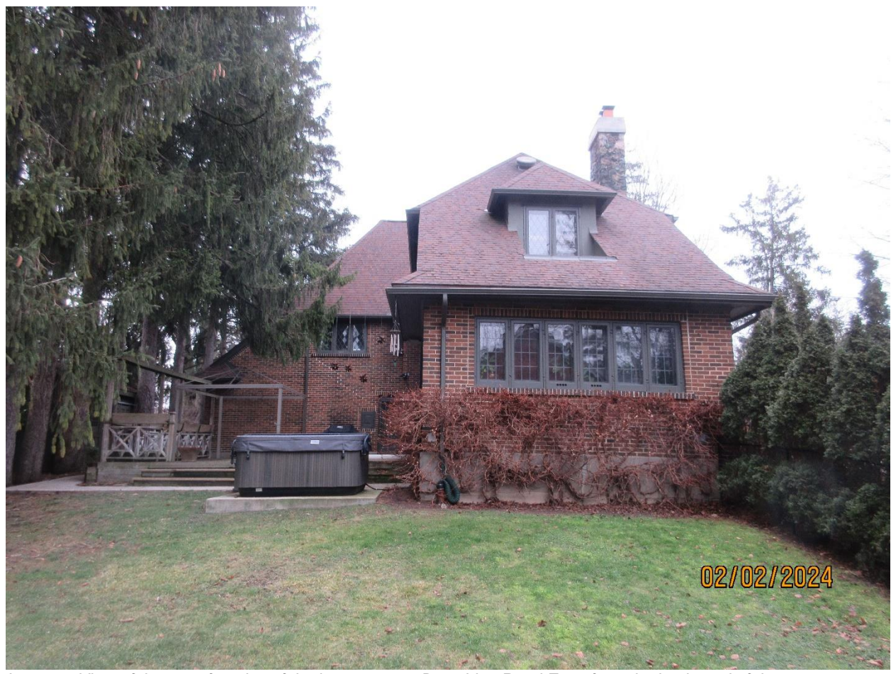
Image 5: View of the west façades of the house at 244 Base Line Road East, from the back yard of the property.