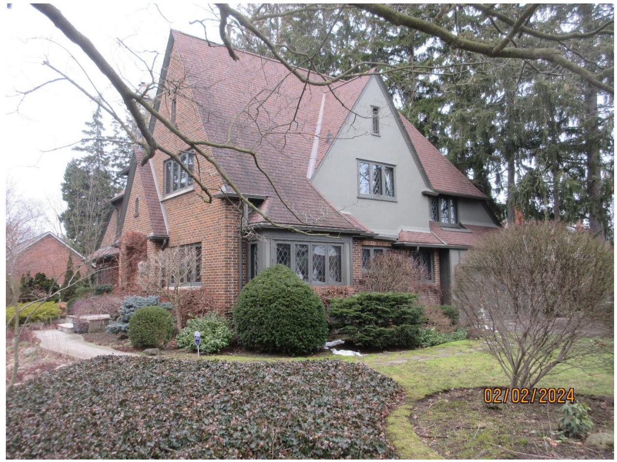
Image 7: View of the south (left) and east (right) facades of the house at 244 Base Line Road East.