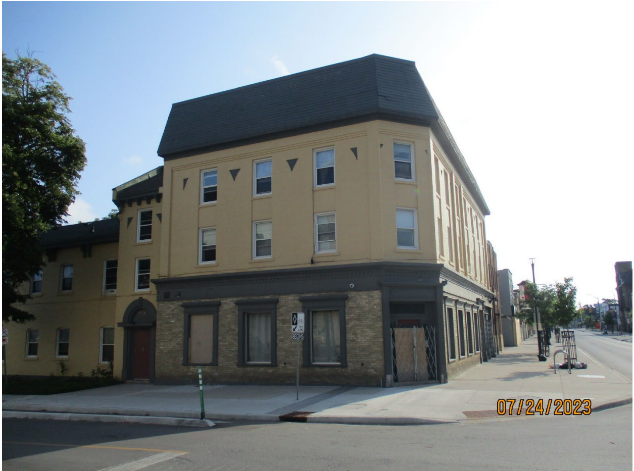
Image 5: Photograph showing the heritage listed property at 754 Dundas Street, the former Hicks Block/Hiscox Block (c.1877). Note, the rear addition at left, fronting onto English Street was used as a hotel as a part of the larger block on Dundas Street.