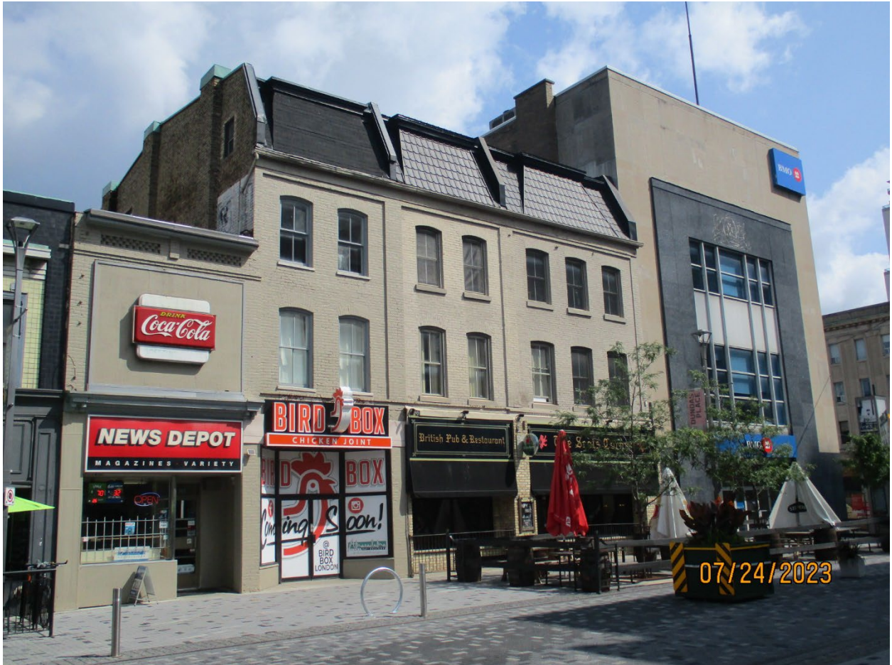
Image 11: Photograph of the heritage designated property at 268 Dundas Street (Horseman House, c. 1888) located within the Downtown Heritage Conservation District.