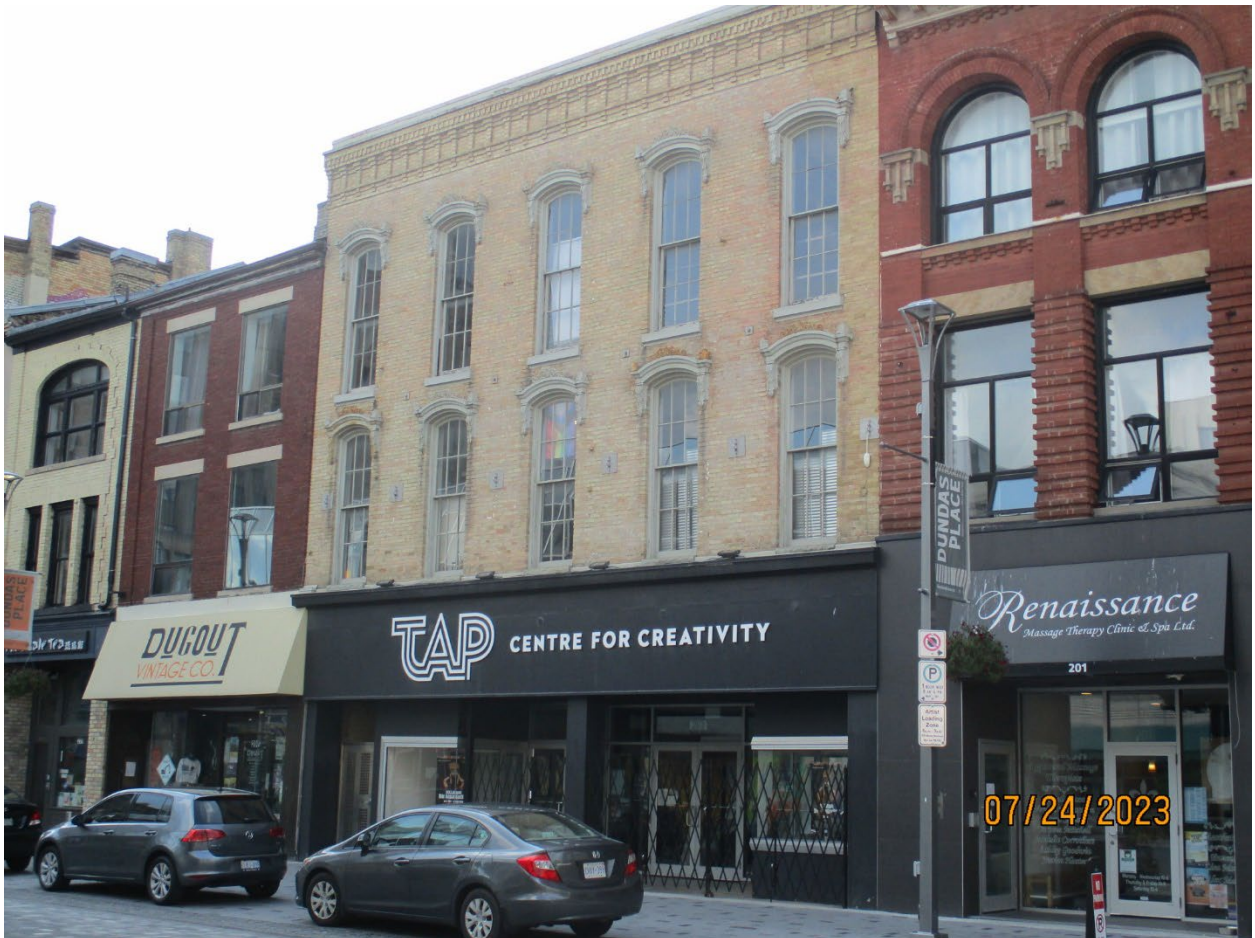
Image 10: Photograph showing the heritage designated property at 268 Dundas Street (Hawthorne's Hotel, c. 1888) located within the Downtown Heritage Conservation District.