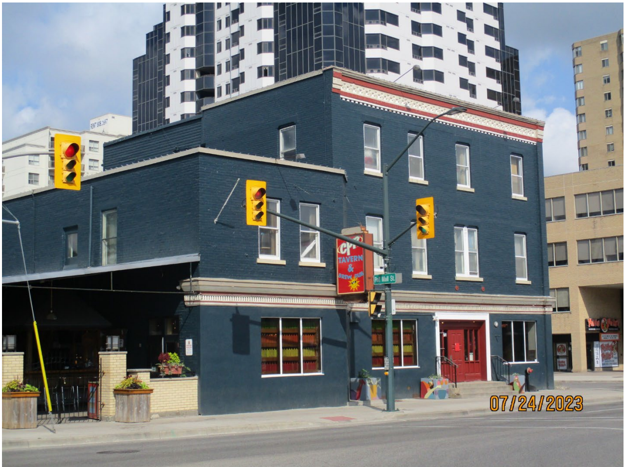
Image 14: Photograph of the heritage listed property located at 651-657 Richmond Street (CPR Hotel, c. 1891).