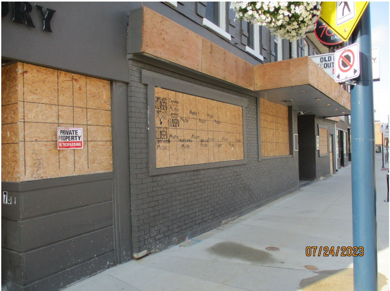
Image 4: Photograph showing the altered first storey of the property located at 763-769 Dundas Street.