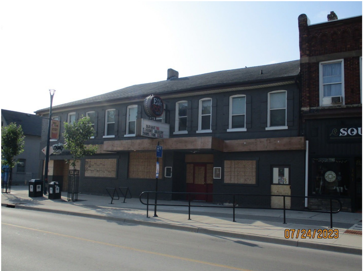
Image 1: Photograph showing the front (north) façade of the property located at 763-769 Dundas Street.