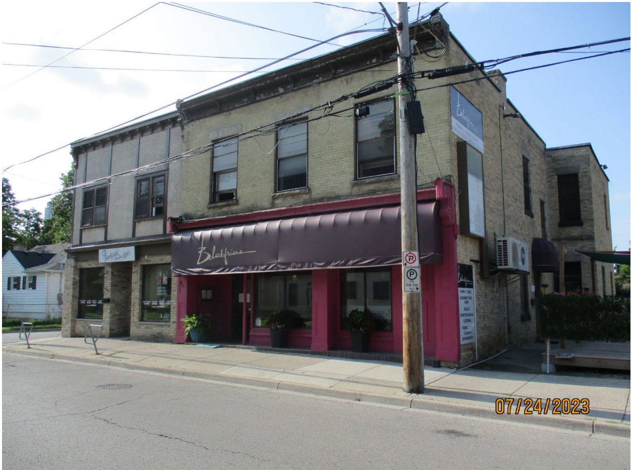
Image 15: Photograph of the heritage designated property located at 44-48 Blackfriars Street (Prince of Wales Hotel, c.1885), in the Blackfriars/Petersville Heritage Conservation District.