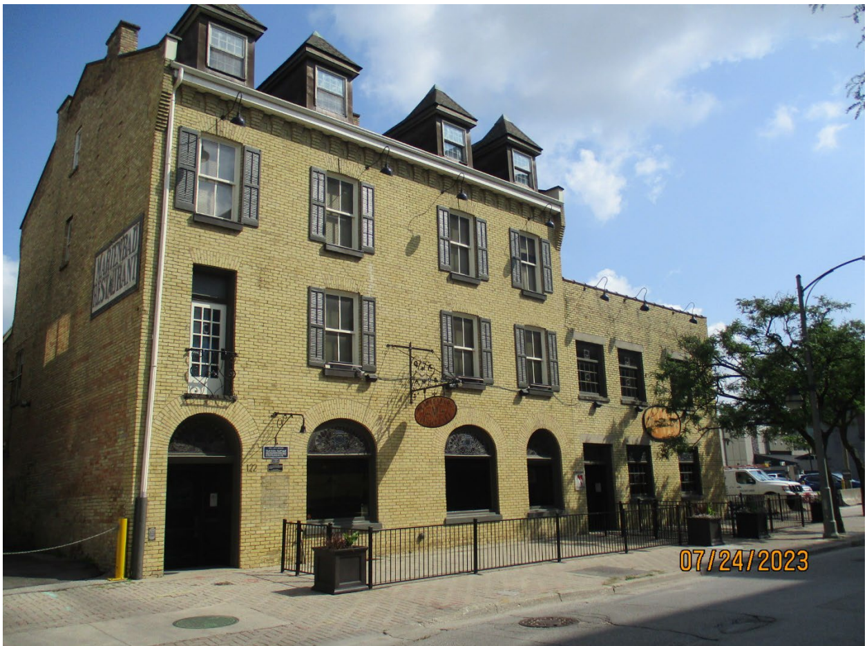
Image 6: Photograph showing the heritage designated property located at 122-126 Carling Street (Queen's Hotel, c.1860), located within the Downtown Heritage Conservation District.