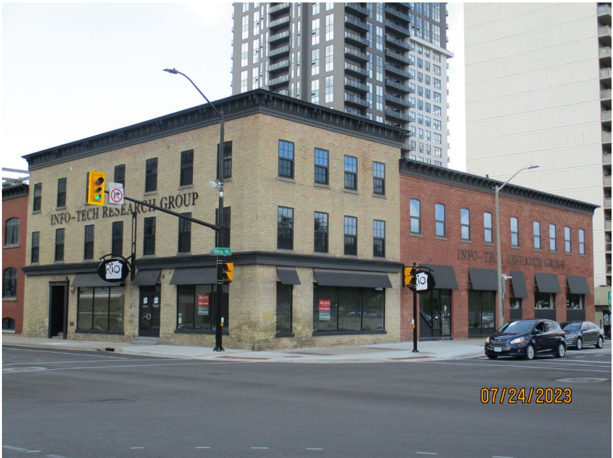
Image 12: Photograph of the heritage designated property located at 355-259 Ridout Street North (Grand Central Hotel, c.1865) located within the Downtown Heritage Conservation District.