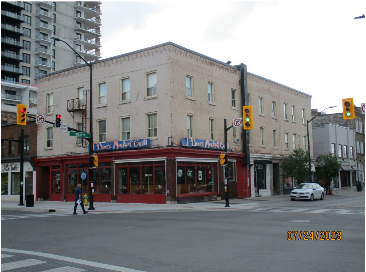
Image 8: Photograph showing the heritage designated property at 360-366 Talbot Street (Bank Hotel, c. 1870), located within the Downtown Heritage Conservation District.