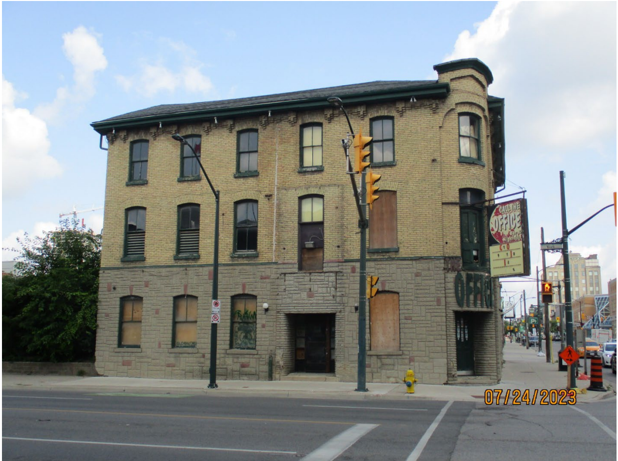
Image 9: Photograph showing the heritage designated property located at 216 York Street (York Hotel, c.1870) located within the Downtown Heritage Conservation District.