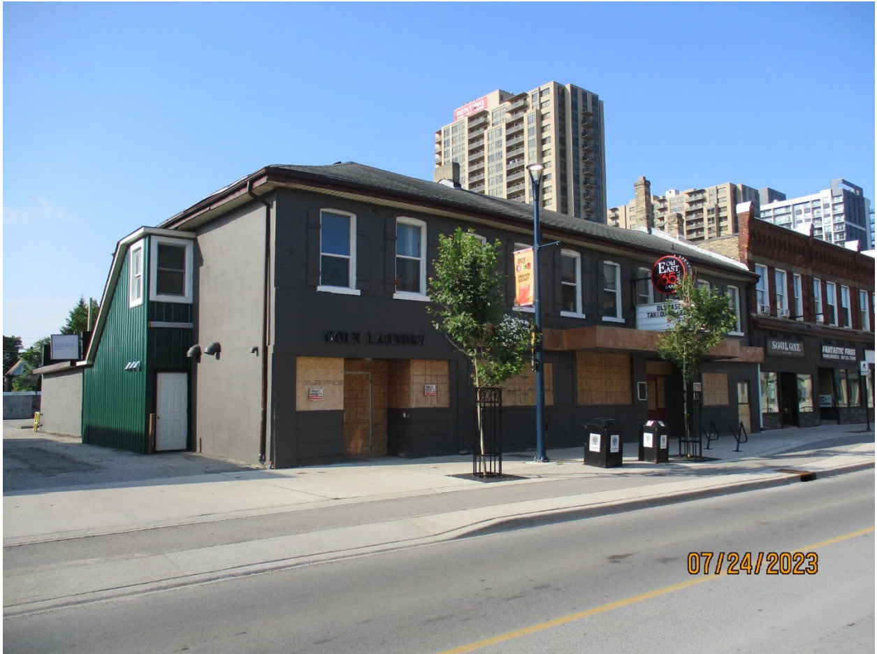
Image 3: Photograph showing the front (north) façade of the property located at 763-769 Dundas Street.