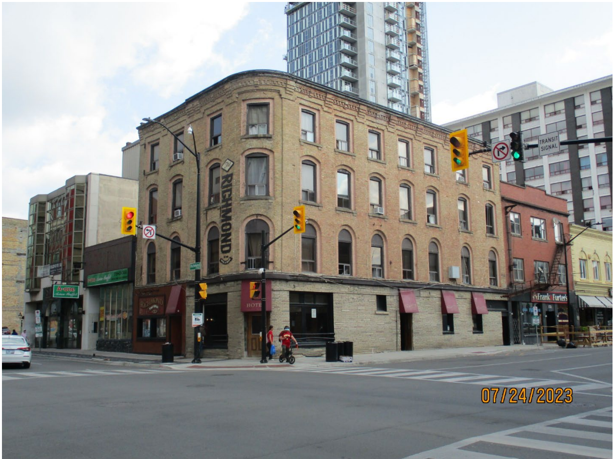
Image 13: Photograph of the heritage designated property at 370 Richmond Street (Richmond Hotel, c. 1860), located within the Downtown Heritage Conservation District.