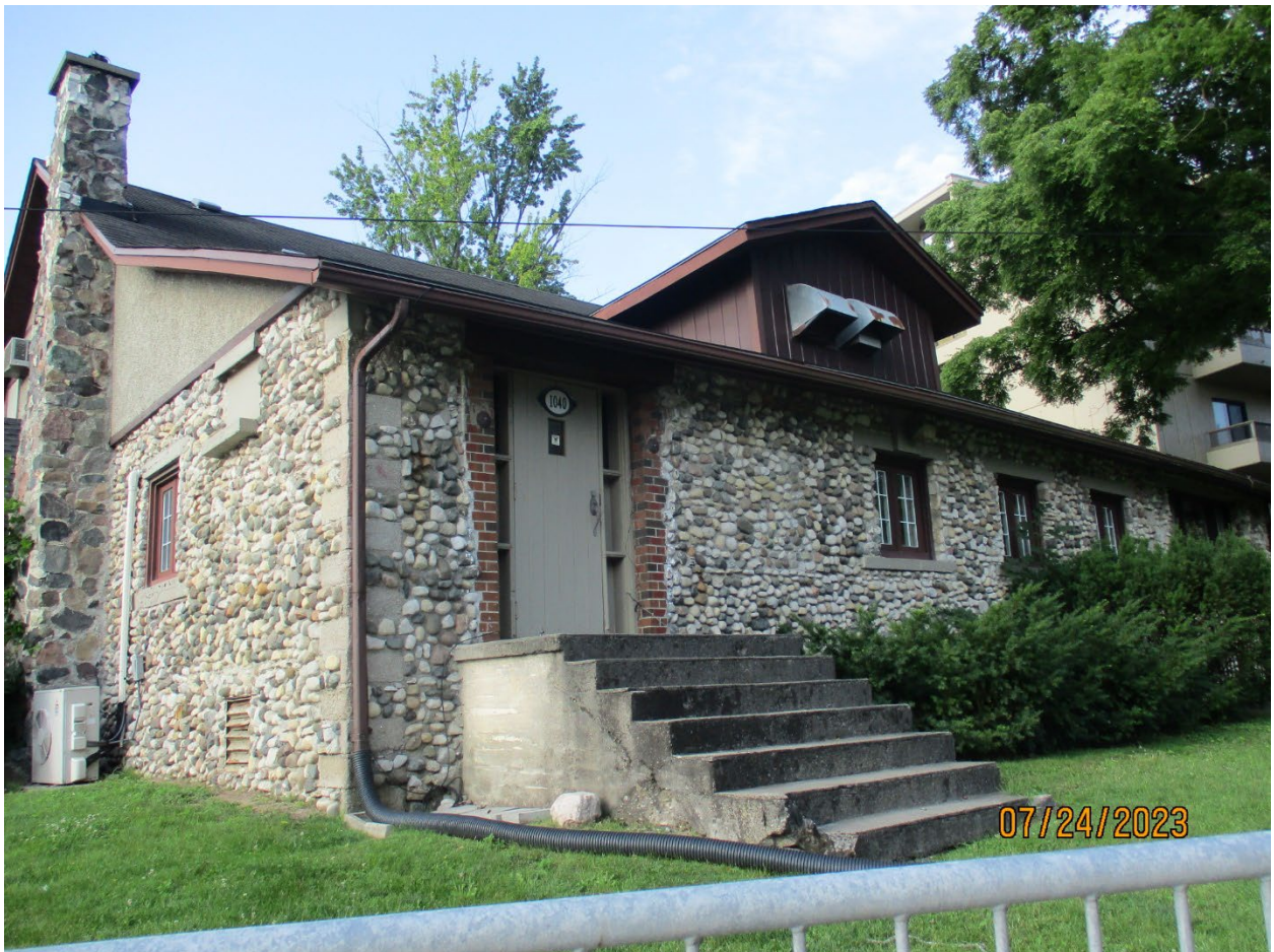
Image 16: Photograph of the heritage-listed property located at 1040 Commissioners Road West (Hermitage Club, 1930).