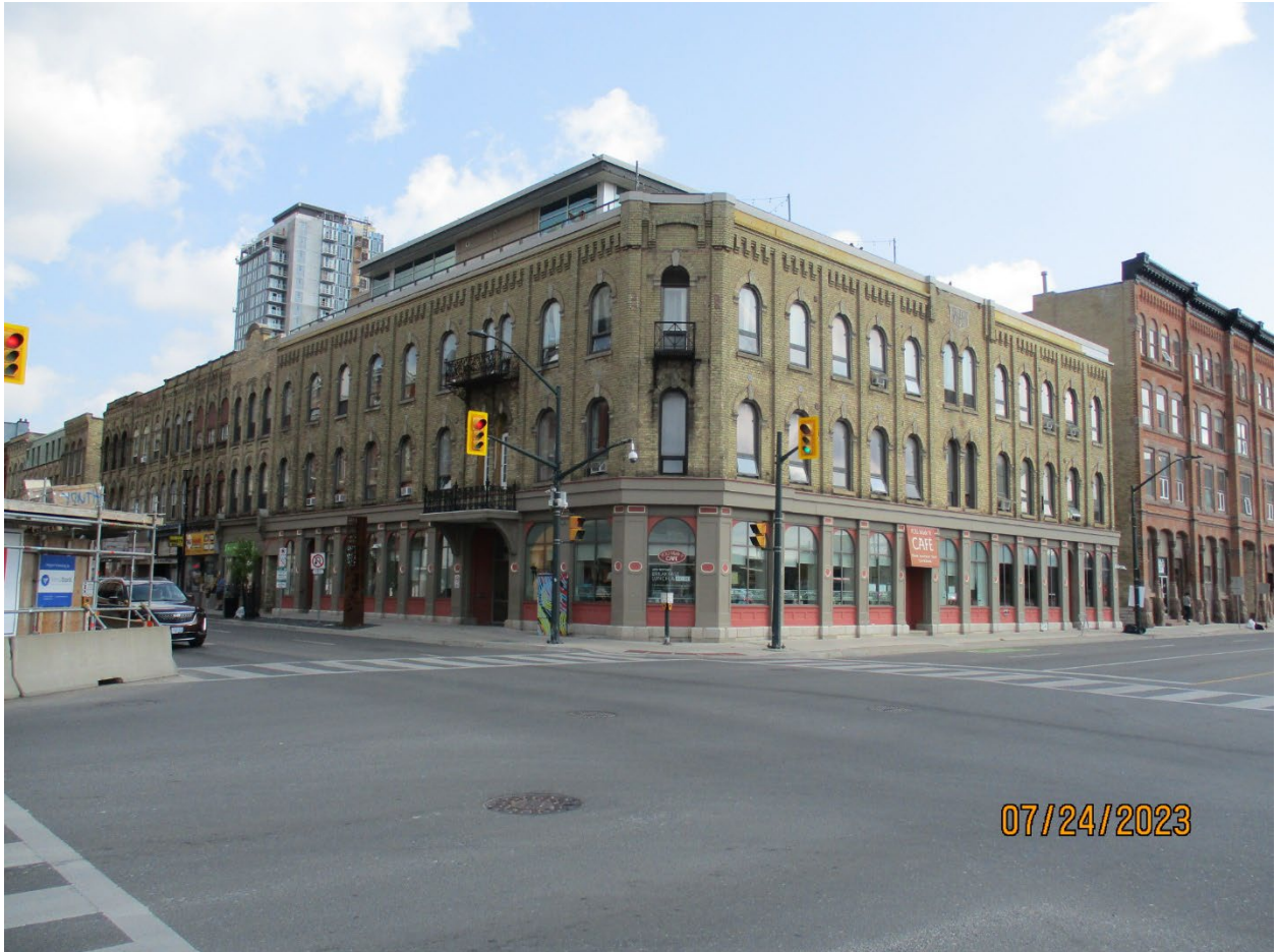
Image 7: Photograph showing the heritage designated property at 332 Richmond Street (Grigg Hotel, c. 1879) located within the Downtown Heritage Conservation District.