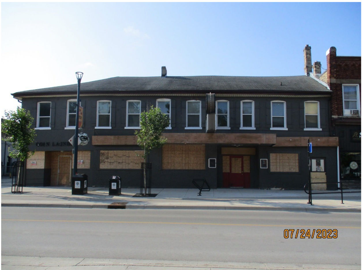
Image 2: Photograph showing the front (north) façade of the property located at 763-769 Dundas Street.