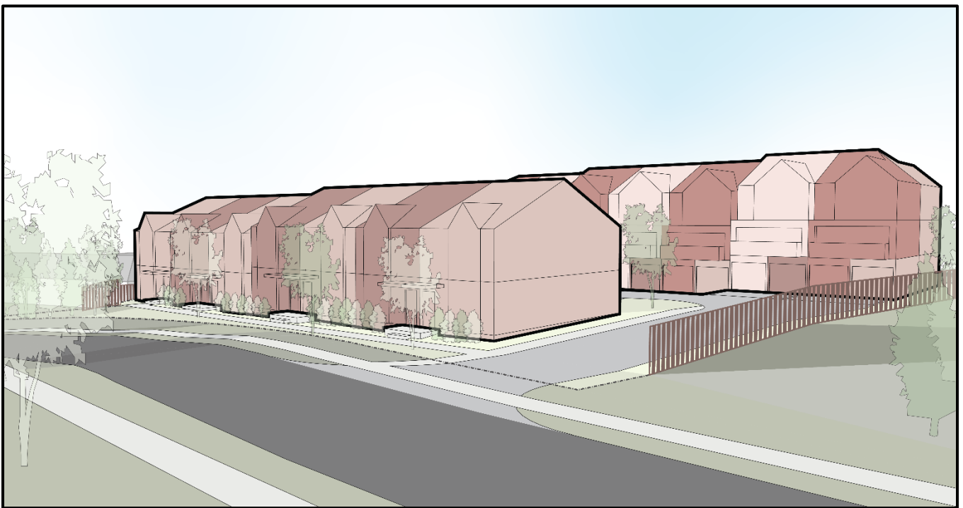
Figure 4. Rendering of Proposed Development.