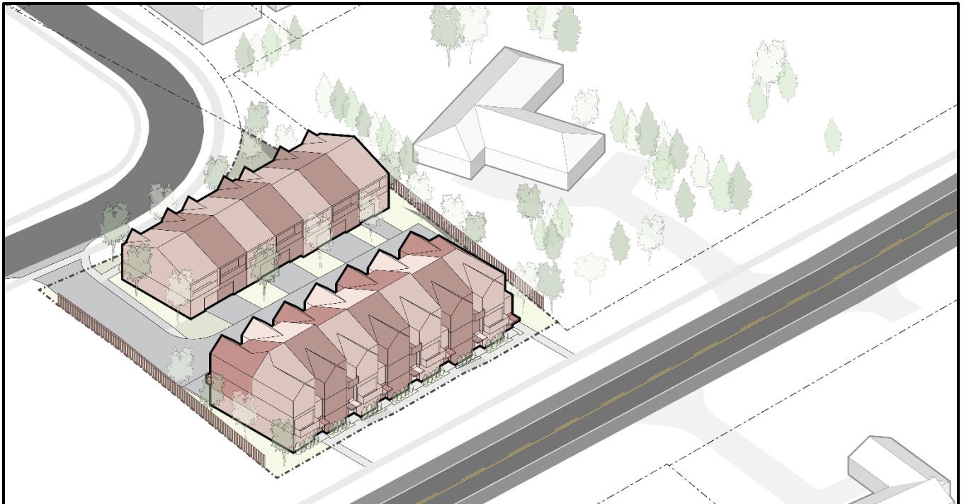
Figure 2. ISO View of Proposed Development.