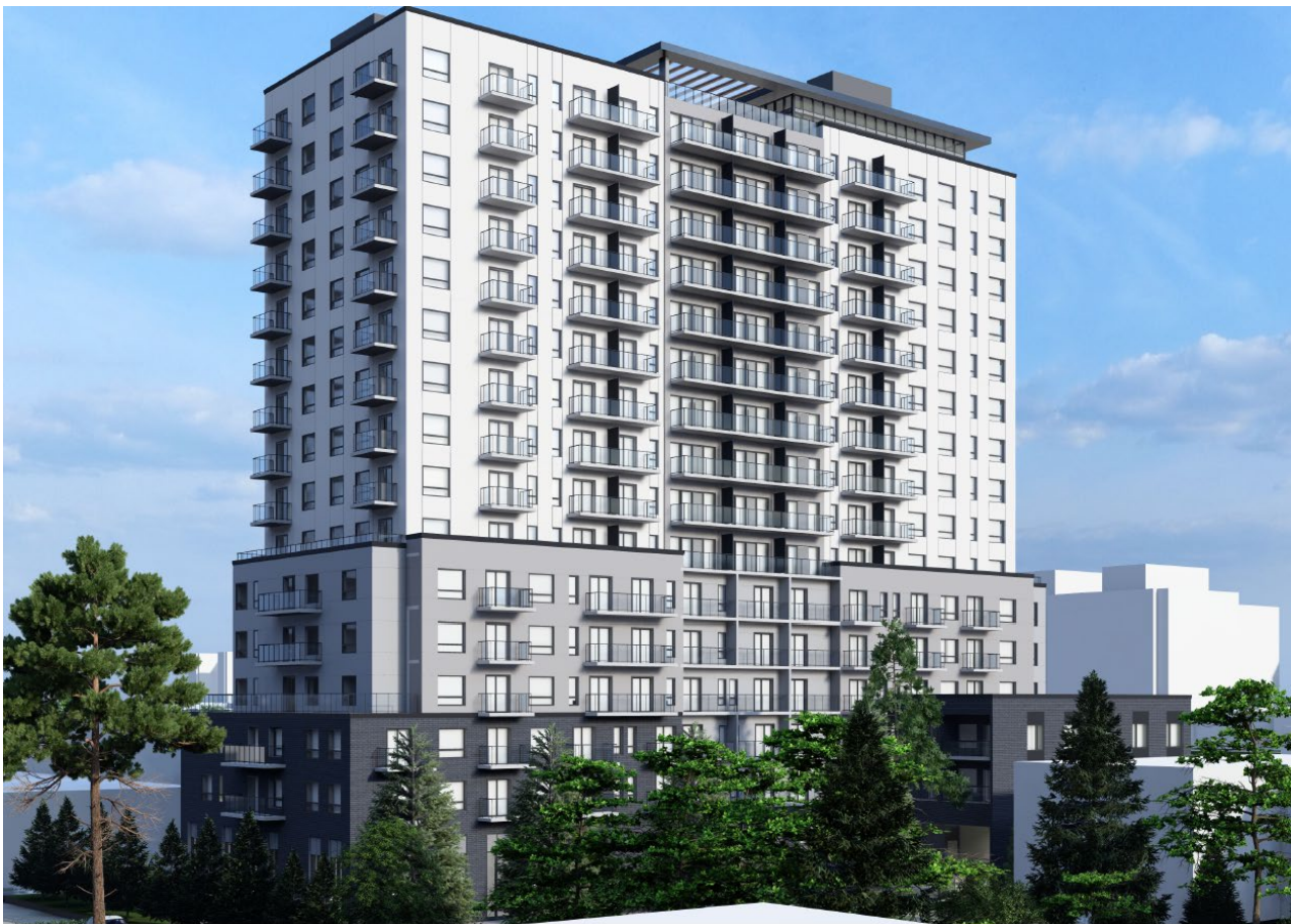
Rendering of building looking southeast from Central Avenue

The above images represent the applicant's proposal as submitted and may change.