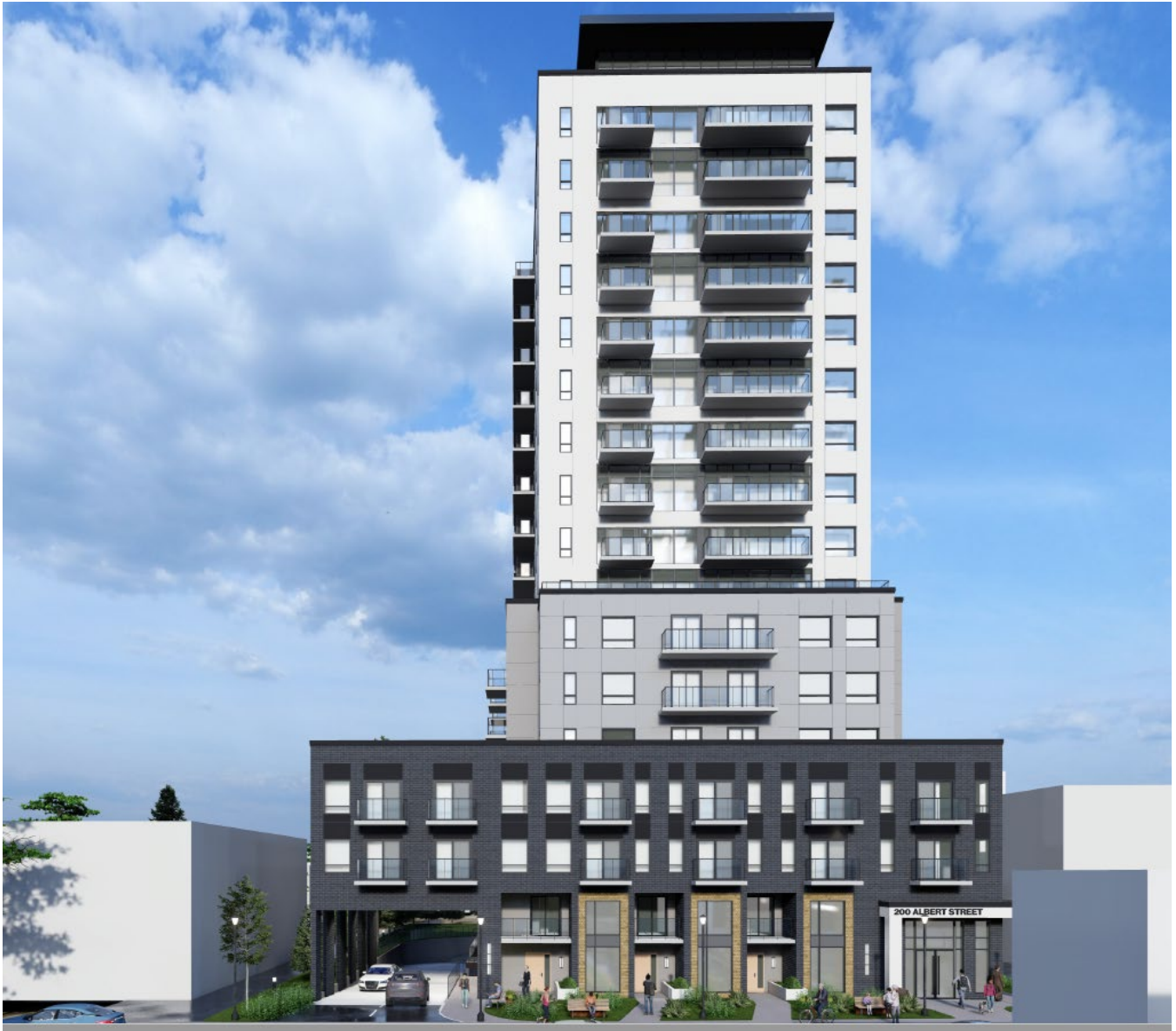
Rendering of building looking north from Albert Street