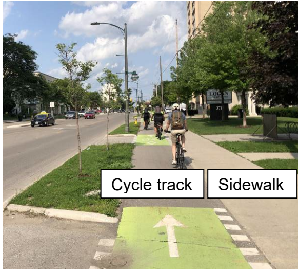
The above figure shows a one-way cycle track beside a sidewalk on Dundas Street