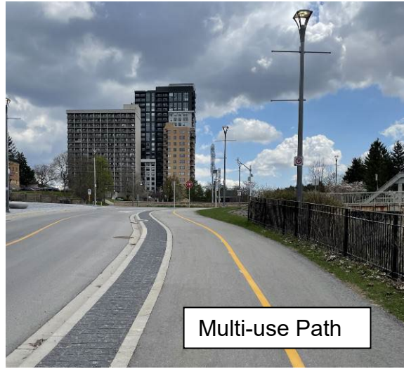
The above figure shows a multi-use path on Thames Street

This project has specific sections where the city-owned right-of-way is constrained and a multi-use path would be the best fit, instead of cycle tracks and sidewalk. We are seeking community feedback about implementing a multi-use path as the preferred solution in specific locations along the corridor.