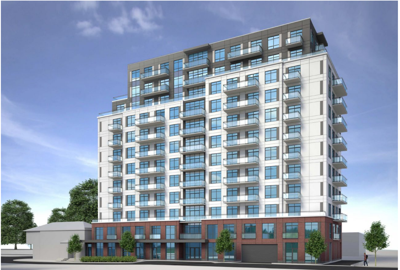
Rendering of building from Central Avenue