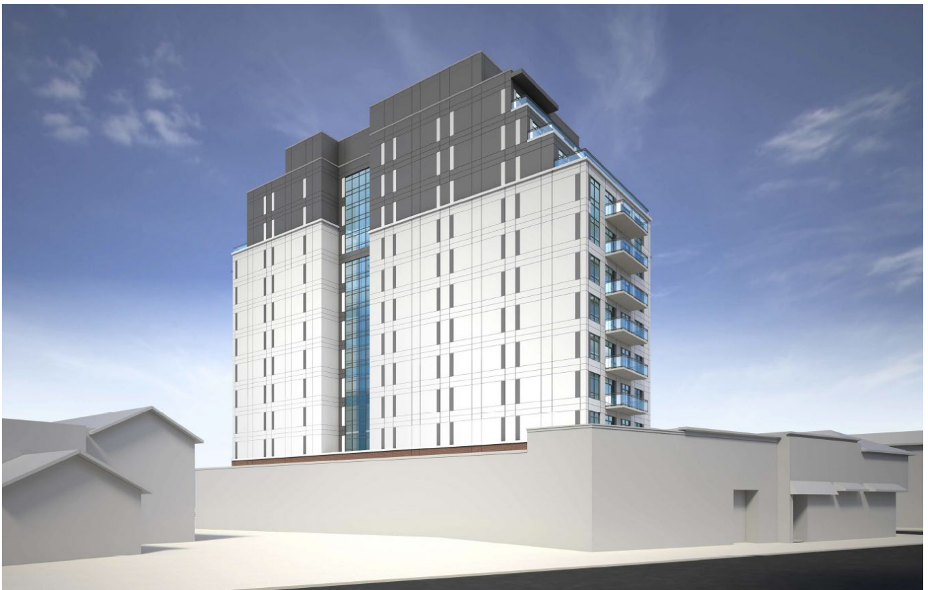
Rendering of building from Richmond Street

The above images represent the applicant's proposal as submitted and may change.