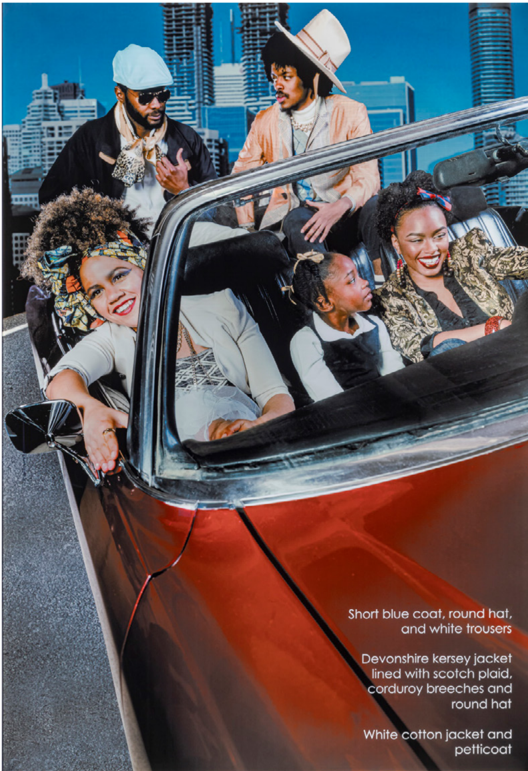
Short blue coat, round hat, and white trousers