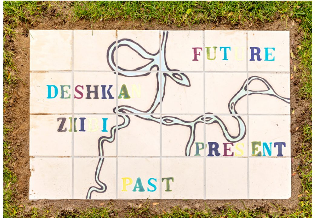
Jamelie Hassan, Map of Deshkan Ziibi , 2021. Porcelain tiles. Courtesy of the Artist. From the exhibition GardenShip and State , October 7, 2021 to January 23, 2022.

Our 2023-2027 strategic plan sets a clear trajectory for the next five years, aligning our purpose with action in areas across our organization.