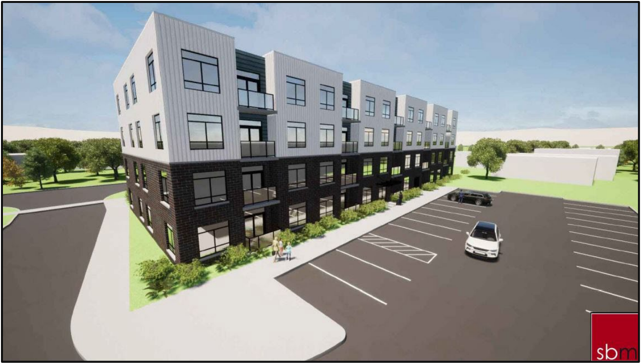
Renderings – rear view of proposed building