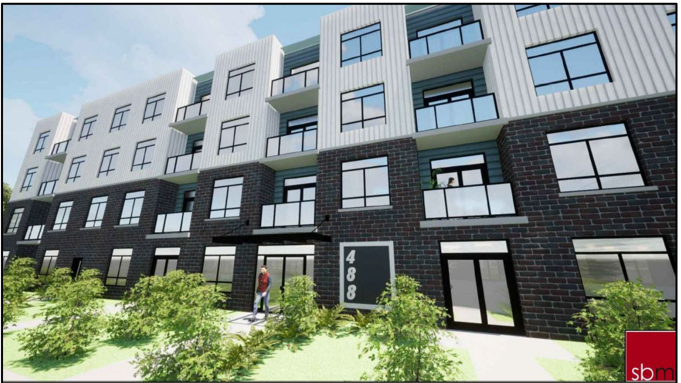
Renderings – pedestrian perspective

The above images represent the applicant's proposal as submitted and may change.