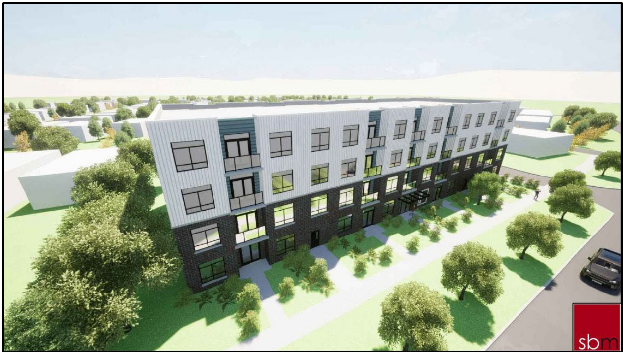
Renderings – view from Pond Mills Road