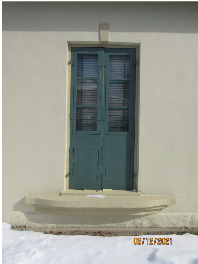
Image 20: Photograph of the painted wood French doors and painted wood storm doors in the northerly opening of the west façade, which retains its cast sill as an indication of the former verandah of Carfrae Cottage. The doorway has a keystone in the parging.