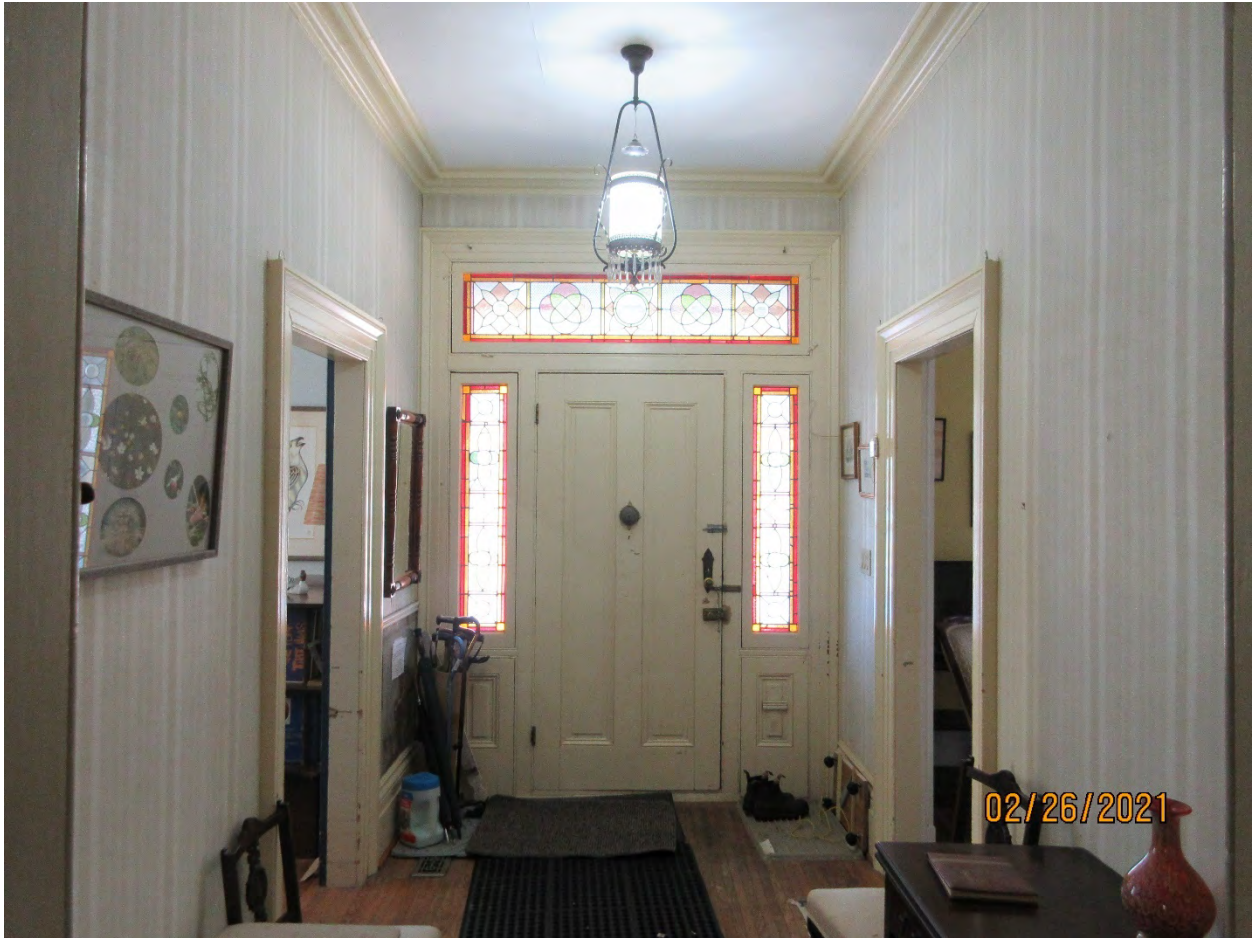
Image 35: Photograph showing the Centre hall, looking towards the front doorway of Carfrae Cottage. Note the baseboards, casing, and crown moulding.