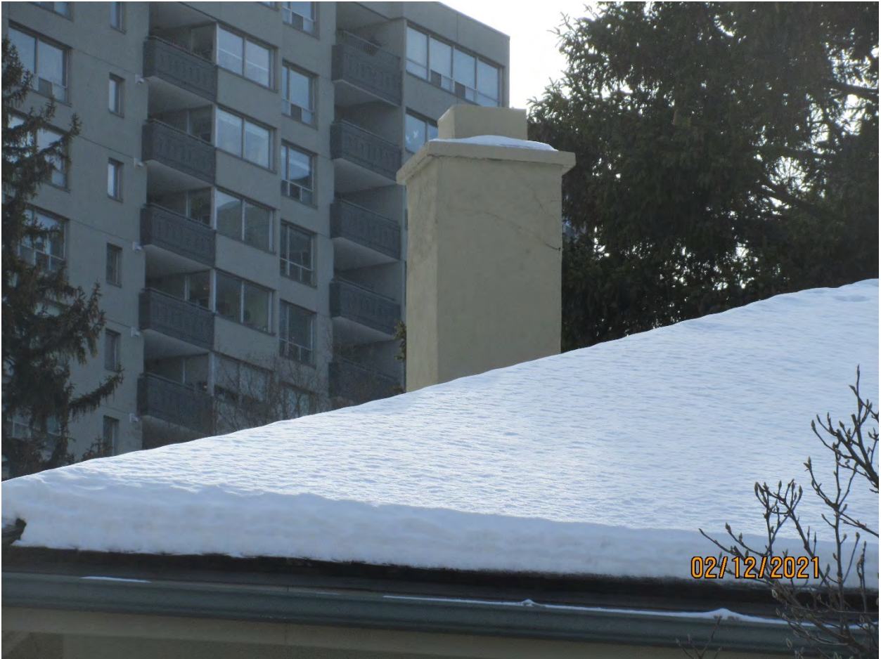
Image 9: Photograph of the east chimney, as seen from Carfrae Street.