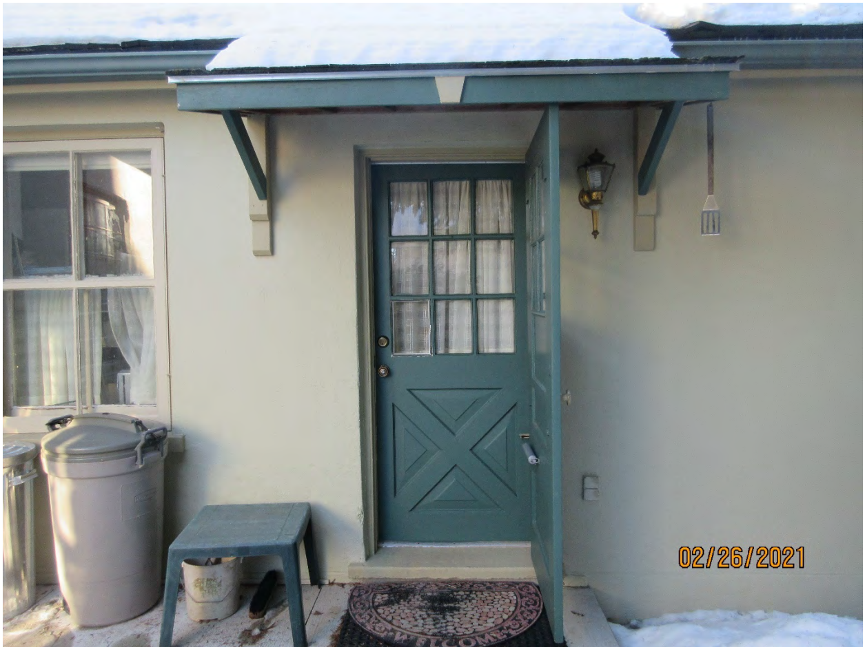
Image 27: Photograph showing the painted wood kitchen door, with nine lites and X-pattern panelling below.