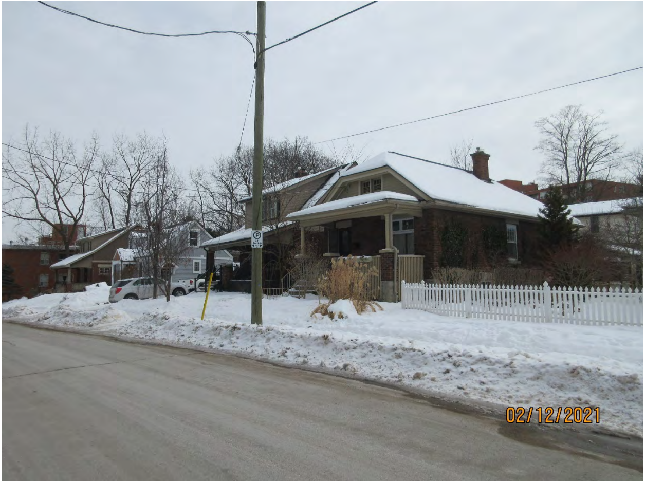
Image 5: View to the east of the property at 39 Carfrae Street, showing the properties at 41 Carfrae Street and 43 Carfrae Street.