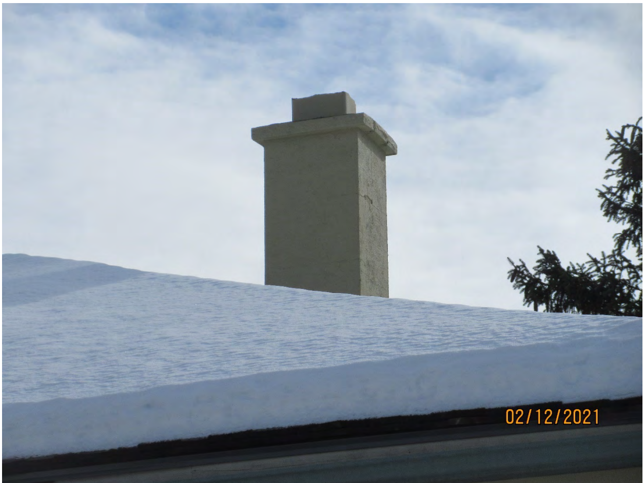
Image 8: Photograph of the west chimney, as seen from Carfrae Street.