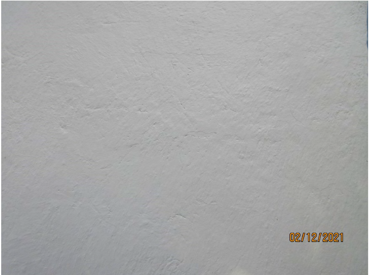
Image 11: Photograph, showing a representative example, of the traditional stucco parging (cementitious smooth textured exterior 'stucco' finish) over the double brick construction of Carfrae Cottage.