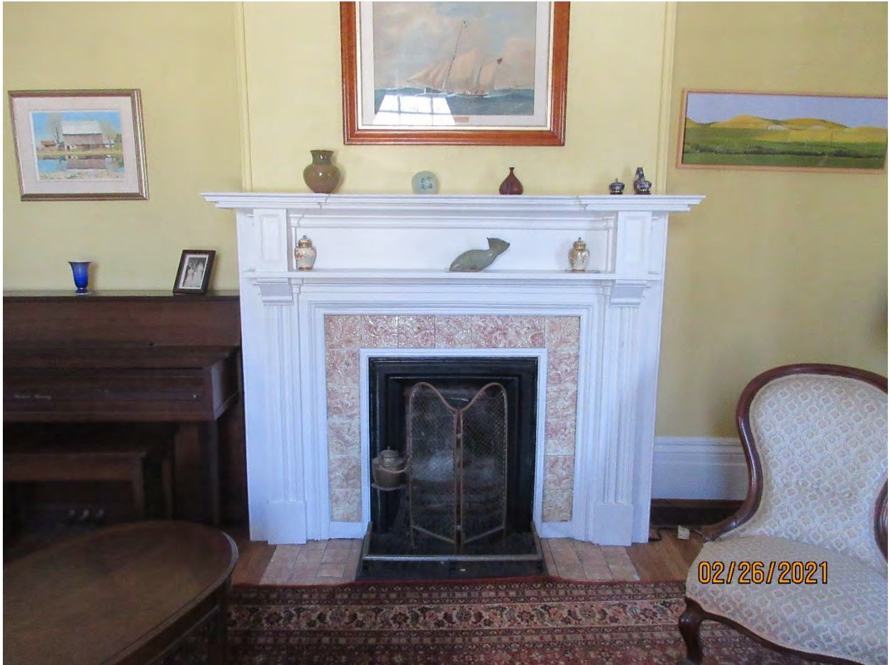
Image 37: Photograph showing the fireplace mantle and tile surround of the "east parlour."