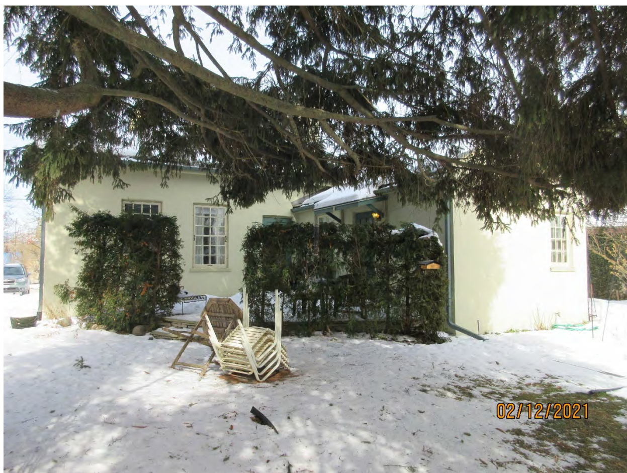
Image 22: View showing the south facade of Carfrae Cottage as well as the kitchen wing.