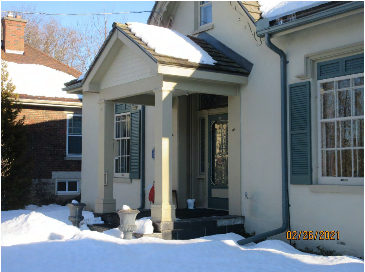
Image 14: Photograph showing the simple form of the painted wood porch over the front doorway, which fails to detract from the original structure, with a cedar shingle gable roof, supported by a plain frieze and boxed piers with simple capital and base details.