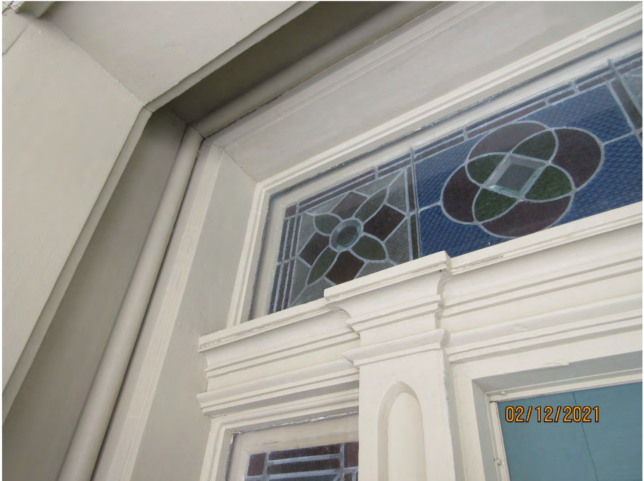
Image 13: Detail photograph showing the entablature of the doorway with Gothic pointed pilaster, as well as a detail of the stained glass transom.