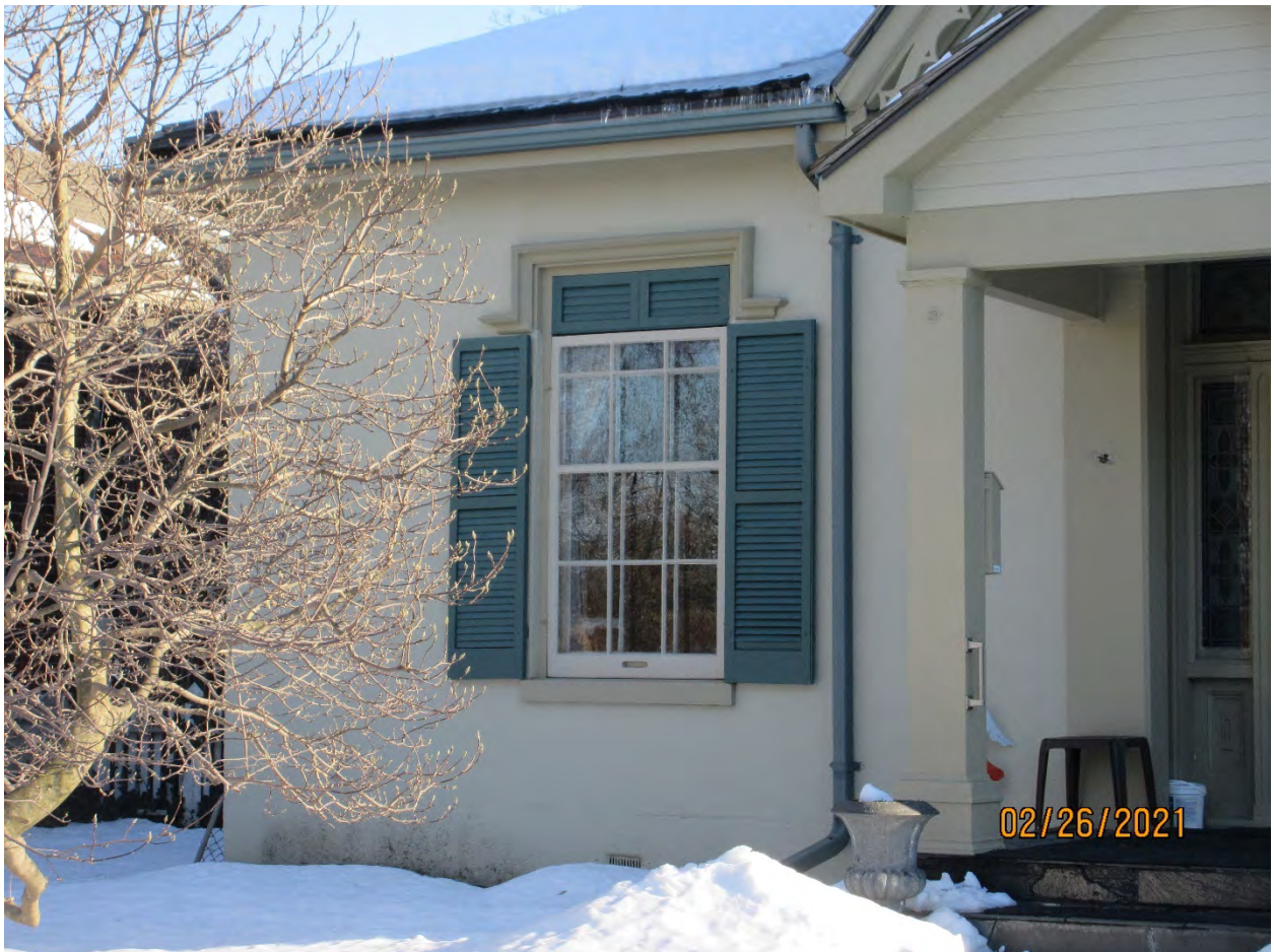
Image 16: View showing the easterly window, storm window, shutters, sill, and label on the front (north) façade of Carfrae Cottage.