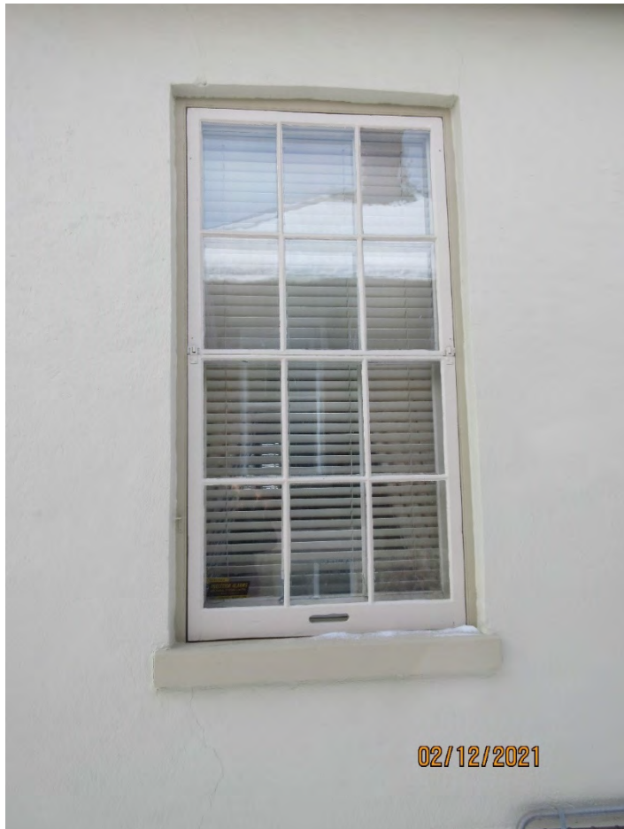
Image 34: Photograph of the six-over-six double hung painted window with matching storm window and wood sill on the east façade.