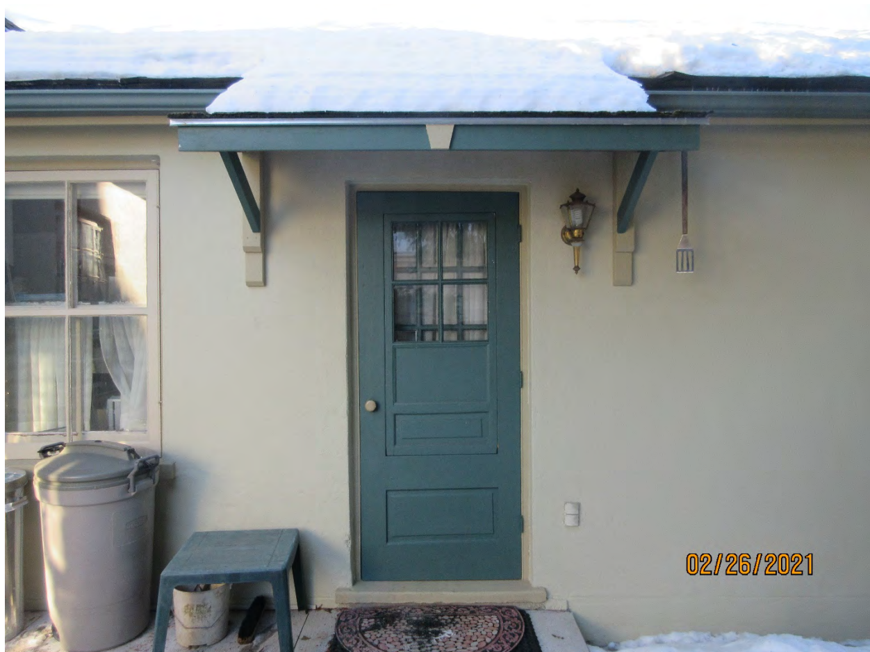
Image 26: Photograph showing the awning over the kitchen doorway as well as the painted storm door.