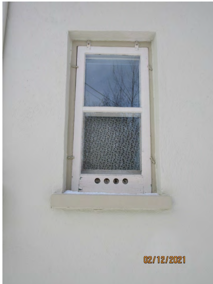
Image 32: Photograph of the bathroom window on the east façade with patterned glass in the lower lite and clear glass in the upper lite of the hung window with a storm window and wood sill.