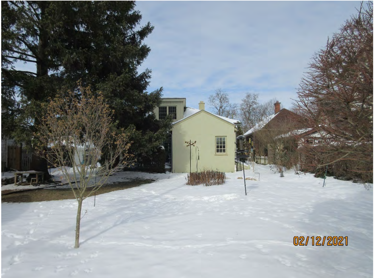
Image 30: View of the south façade of Carfrae Cottage, as seen from the rear (southerly) property boundary along Ardaven Place.