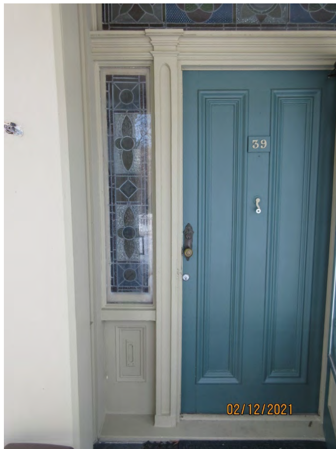
Image 12: Photograph showing the front doorway with single leaf, painted wood door with two long panels (which is believed to be original to the house), set in a rectangular opening with rectangular sidelights to both sides, a panelled dado below, and a rectangular transom. The sidelights and transom feature stained glass in repetitive geometric patterns with coloured and textured glass. The doorway is recessed in the façade with a plain reveal. The door opening is framed by pilasters with a Gothic point, with entablature supporting the architectural framework of the doorway.