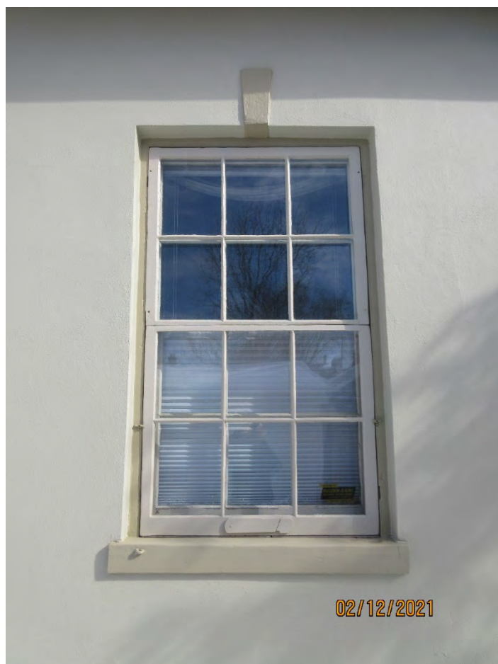
Image 21: Photograph of the painted wood six-over-six shingle hung wood window with storm windows that replicate the six-over-six fenestration. The window opening has a keystone in the parging and a wood sill.