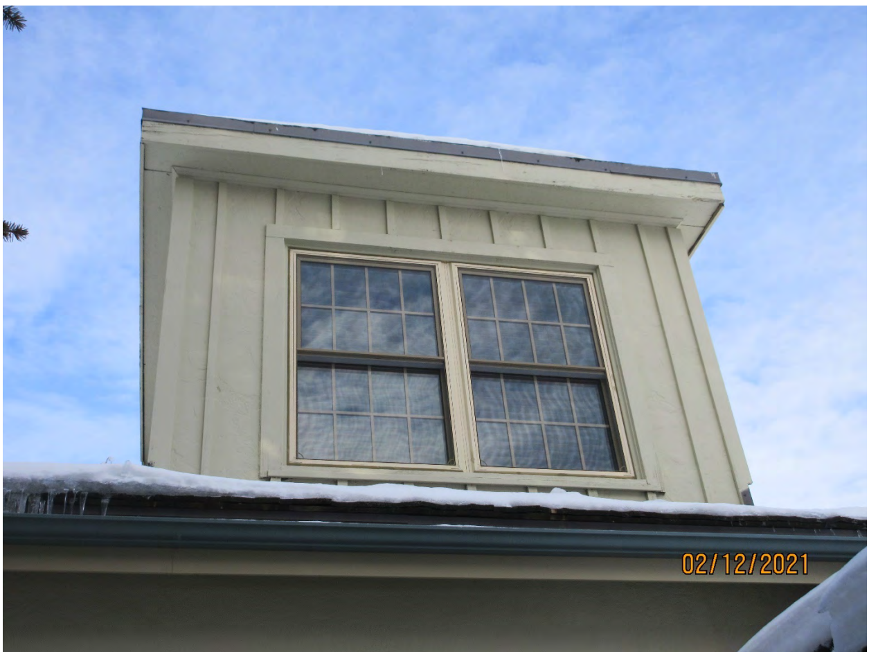
Image 28: Photograph of the shed roof dormer on the south façade of Carfrae Cottage.