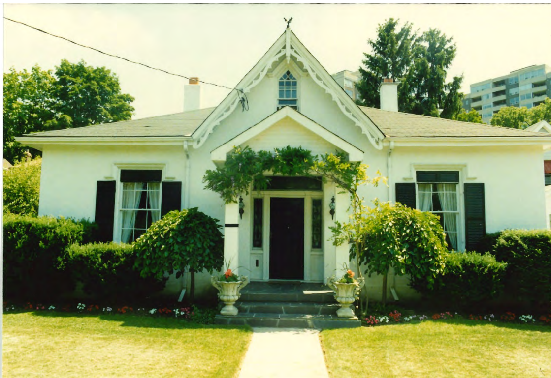
Image 1: Photograph of Carfrae Cottage in 1988 at the time of its designation pursuant to Section 29 of the Ontario Heritage Act.