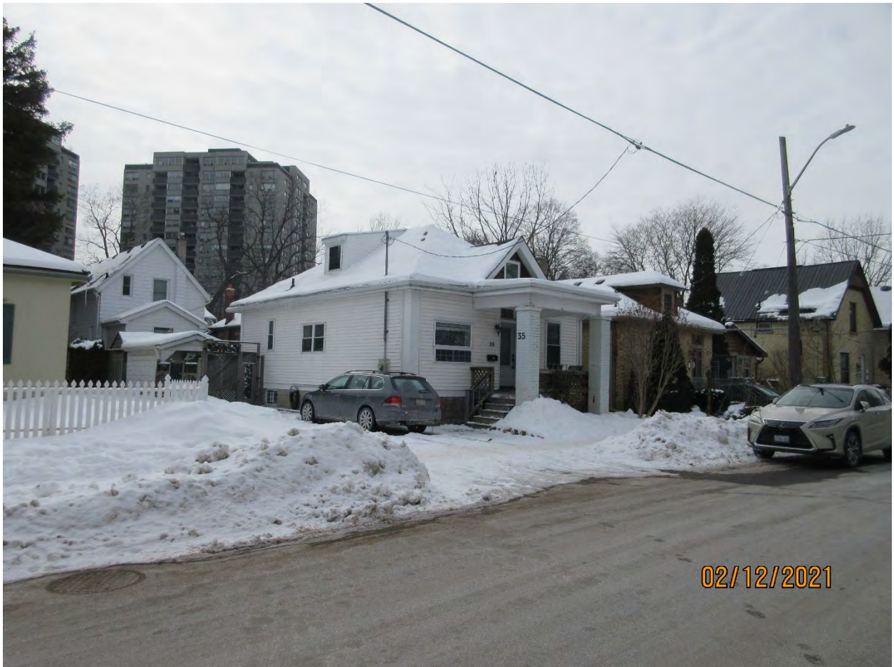
Image 6: View to the west of the property at 39 Carfrae Street, showing the property at 35 Carfrae Street.