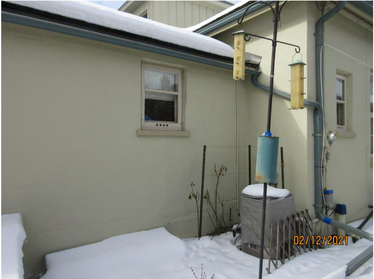
Image 31: Showing the junction of the kitchen wing and the house along the easterly façade of Carfrae Cottage.