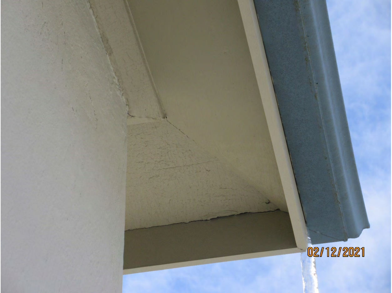
Image 10: Photograph showing the sloped, painted wood soffit of the roofline.