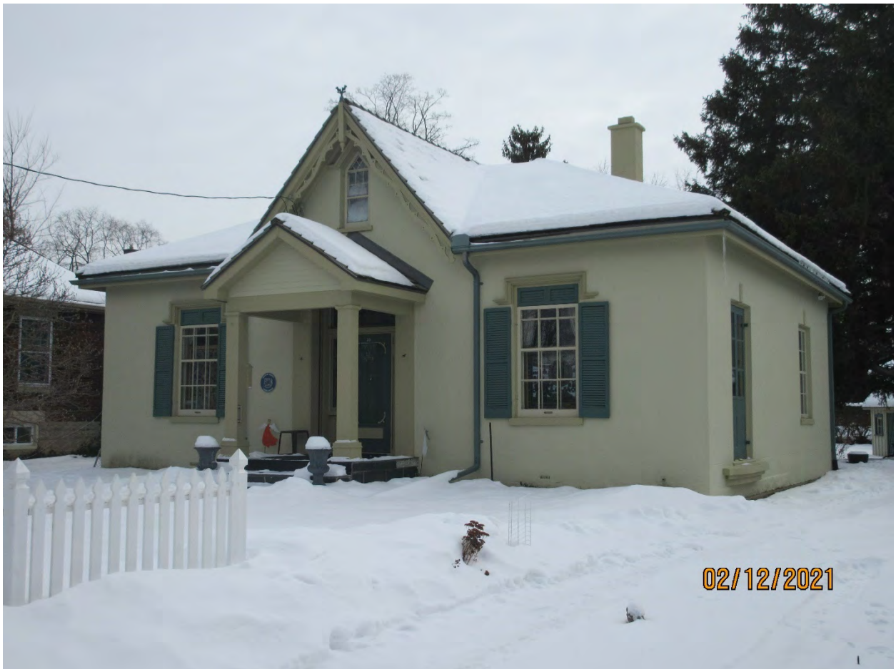
Image 4: View of Carfrae Cottage, looking southeast from the northwest corner of the property at 39 Carfrae Street.