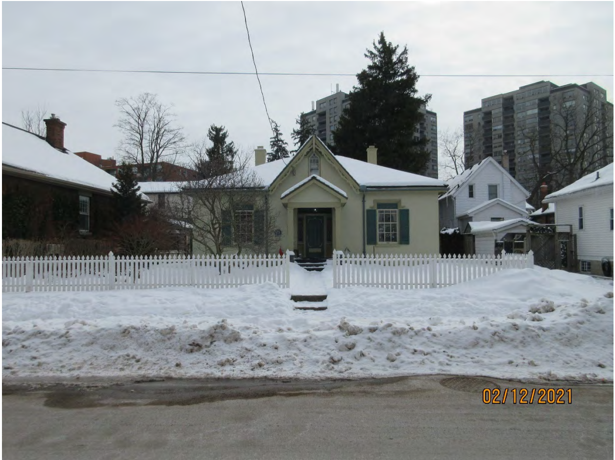
Image 3: View of the property at 39 Carfrae Street, looking south to the front (north) facade of Carfrae Cottage.