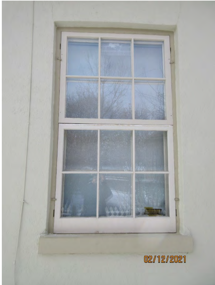
Image 33: Photograph of the six-over-six painted wood window with matching storm windows and an aluminum-clad sill.