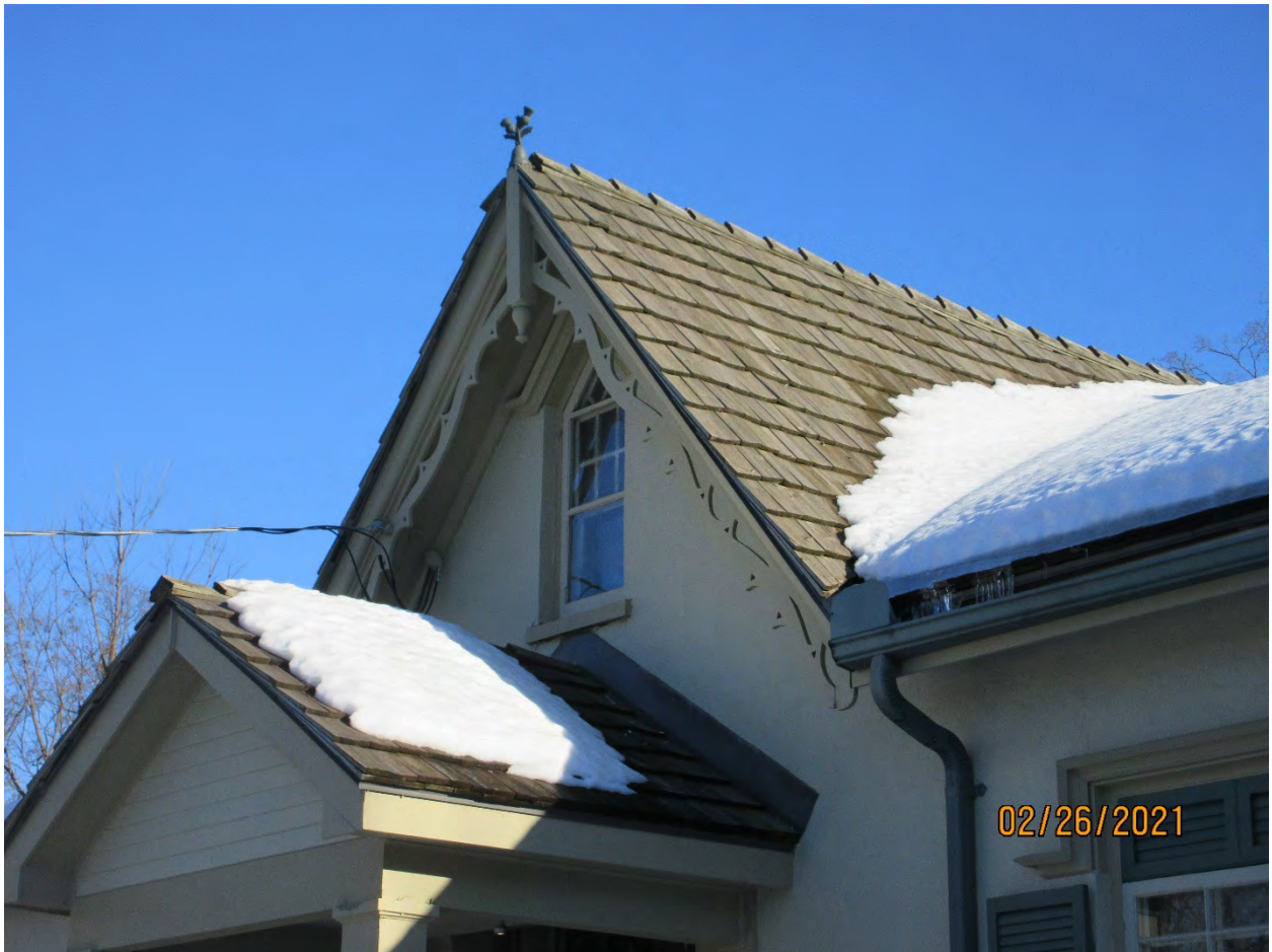
Image 18: View of the central gable dormer on the front (north) facade of Carfrae Cottage with a primitive Gothic pointed wood window and matching storm window. The decorative wood bargeboard of the central gable dormer is also shown, as well as the Scotch thistle.