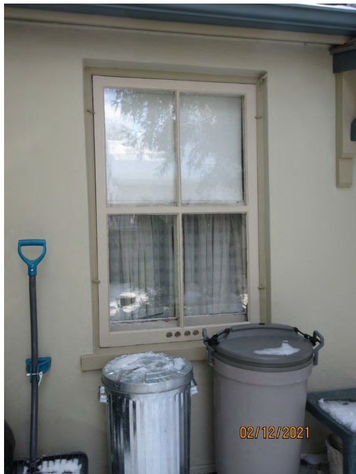
Image 25: Photograph showing the two-over-two painted wood window and storm window in the kitchen wing.