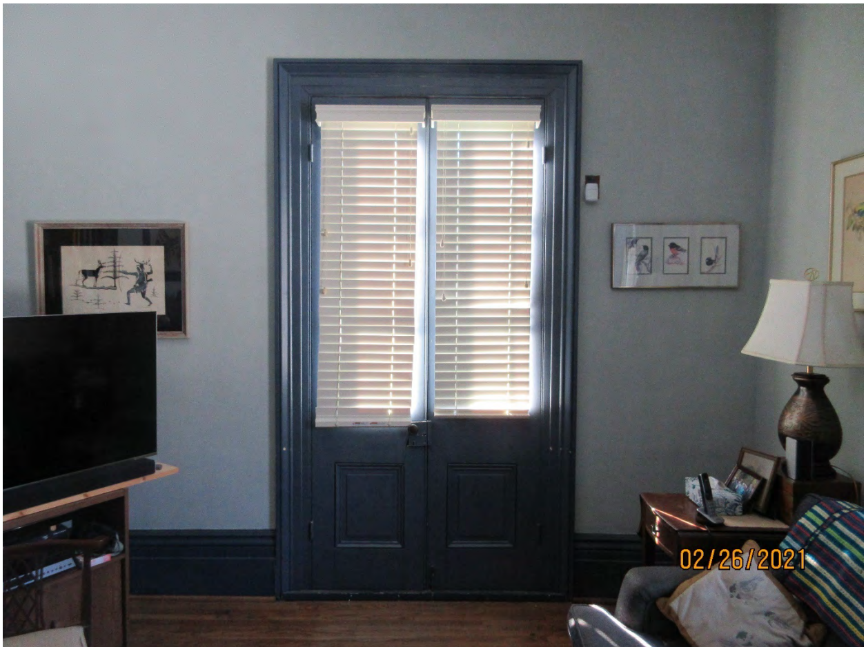
Image 40: Photograph showing the French Doors in the "west parlour" of Carfrae Cottage. See Image 20 for exterior view of the French Doors.