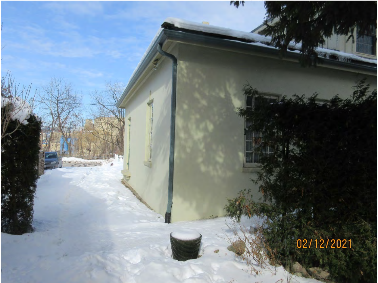
Image 19: View of the west and south facades of Carfrae Cottage, and showing the driveway along the westerly property boundary.