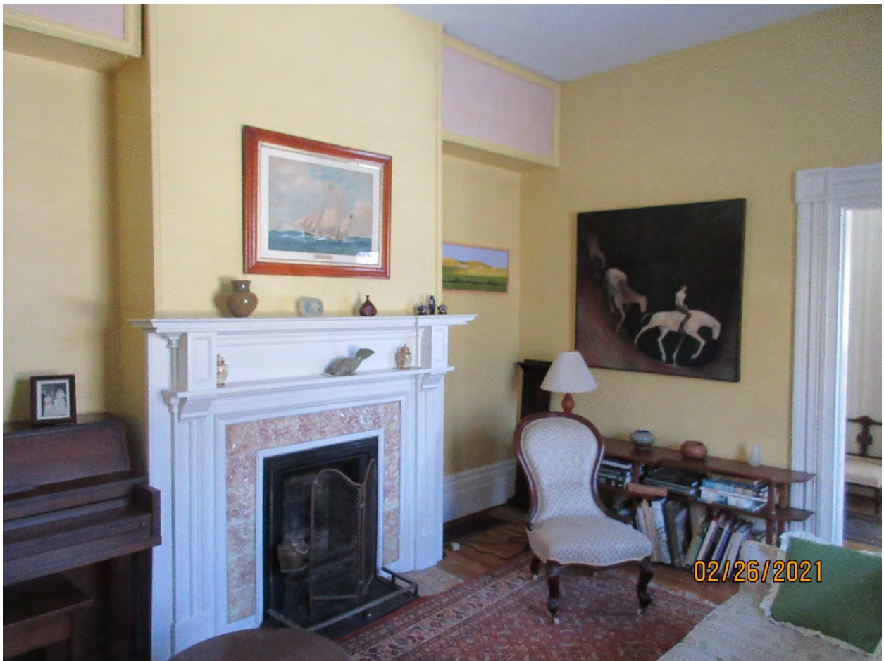
Image 38: Photograph showing an example of the baseboards and casing of the "east parlour".