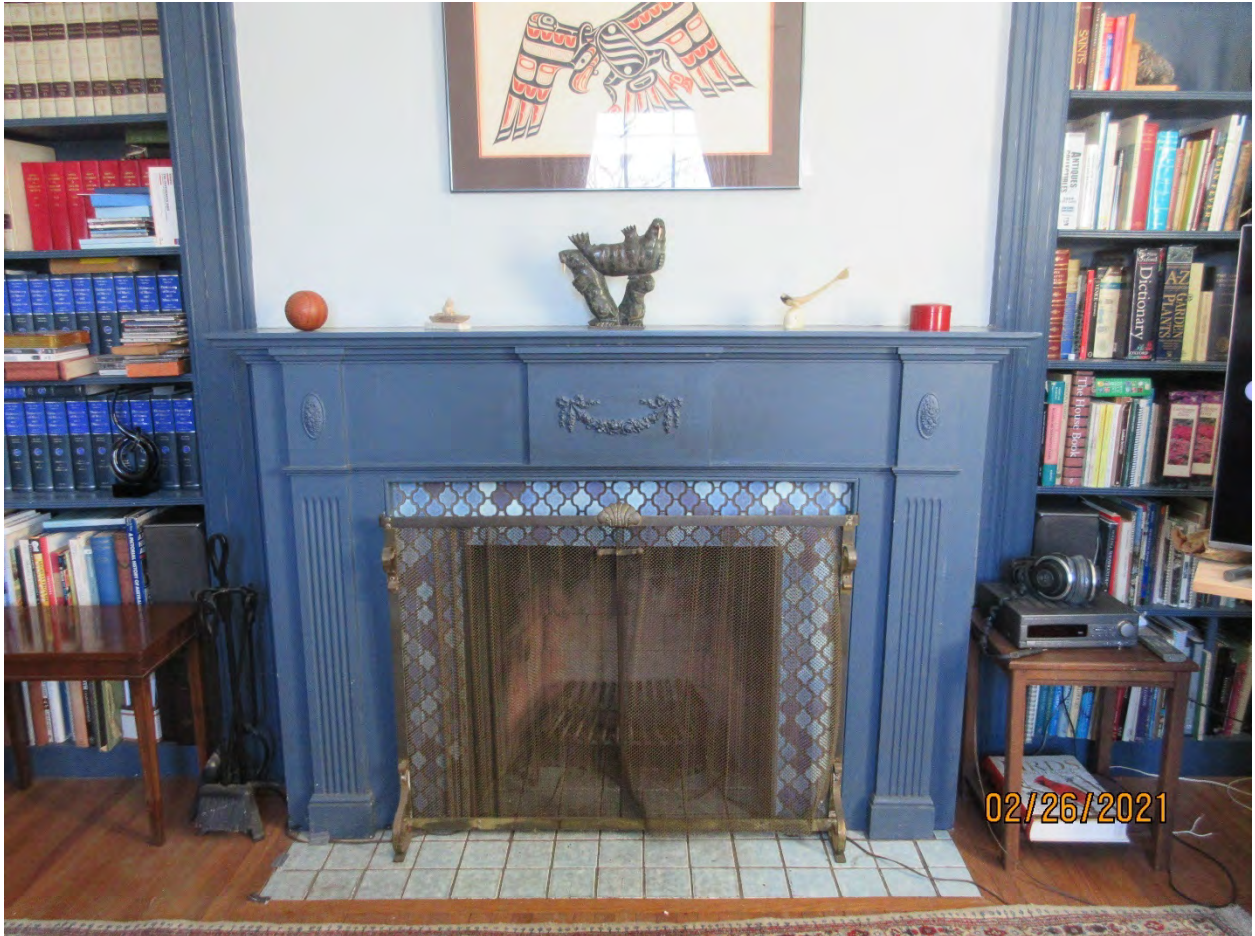
Image 39: Photograph showing the fireplace mantle and tile surround of the "west parlour."