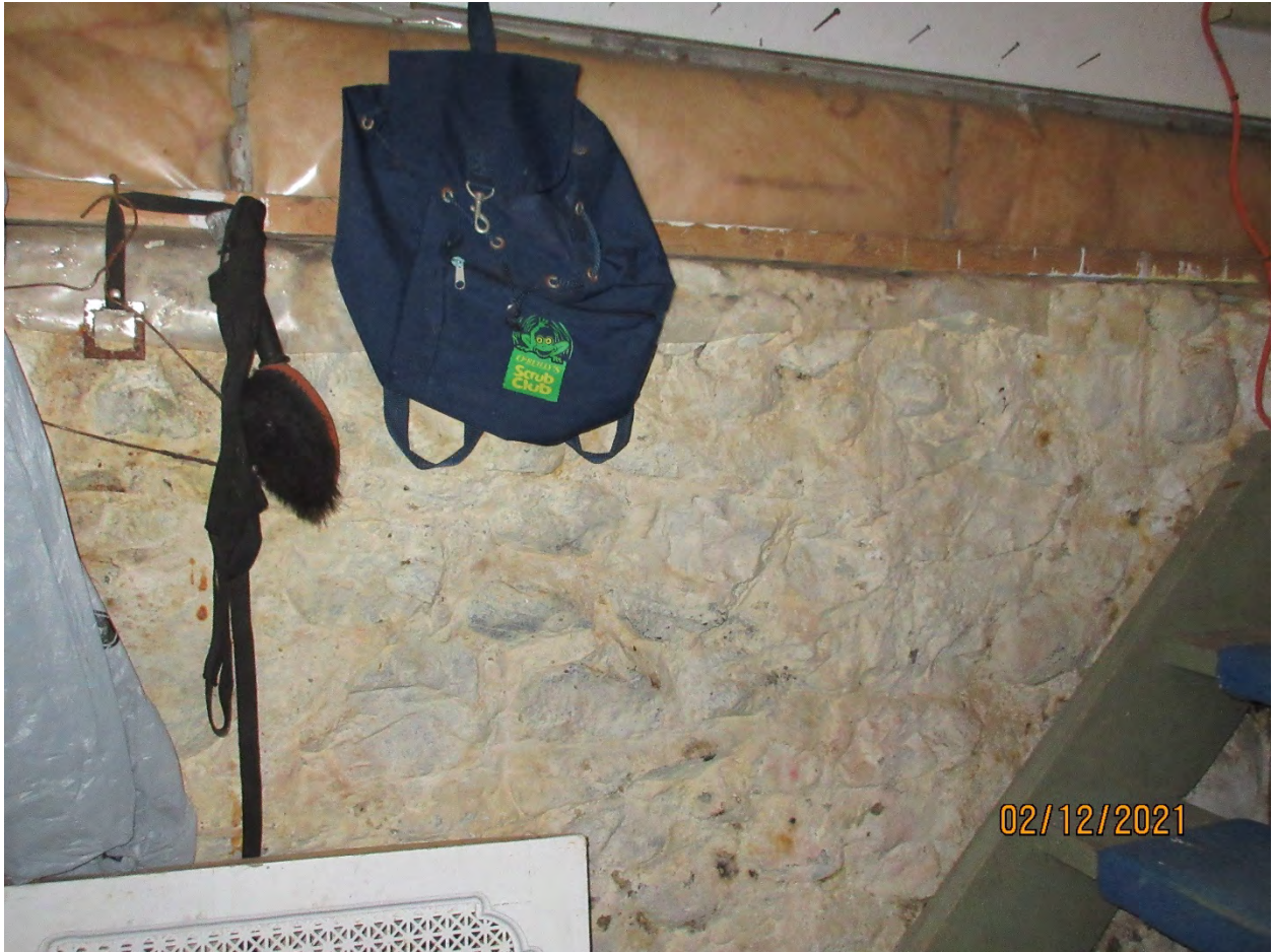
Image 7: Photograph showing an example of the rubble stone foundation construction of Carfrae Cottage, as seen in the basement.