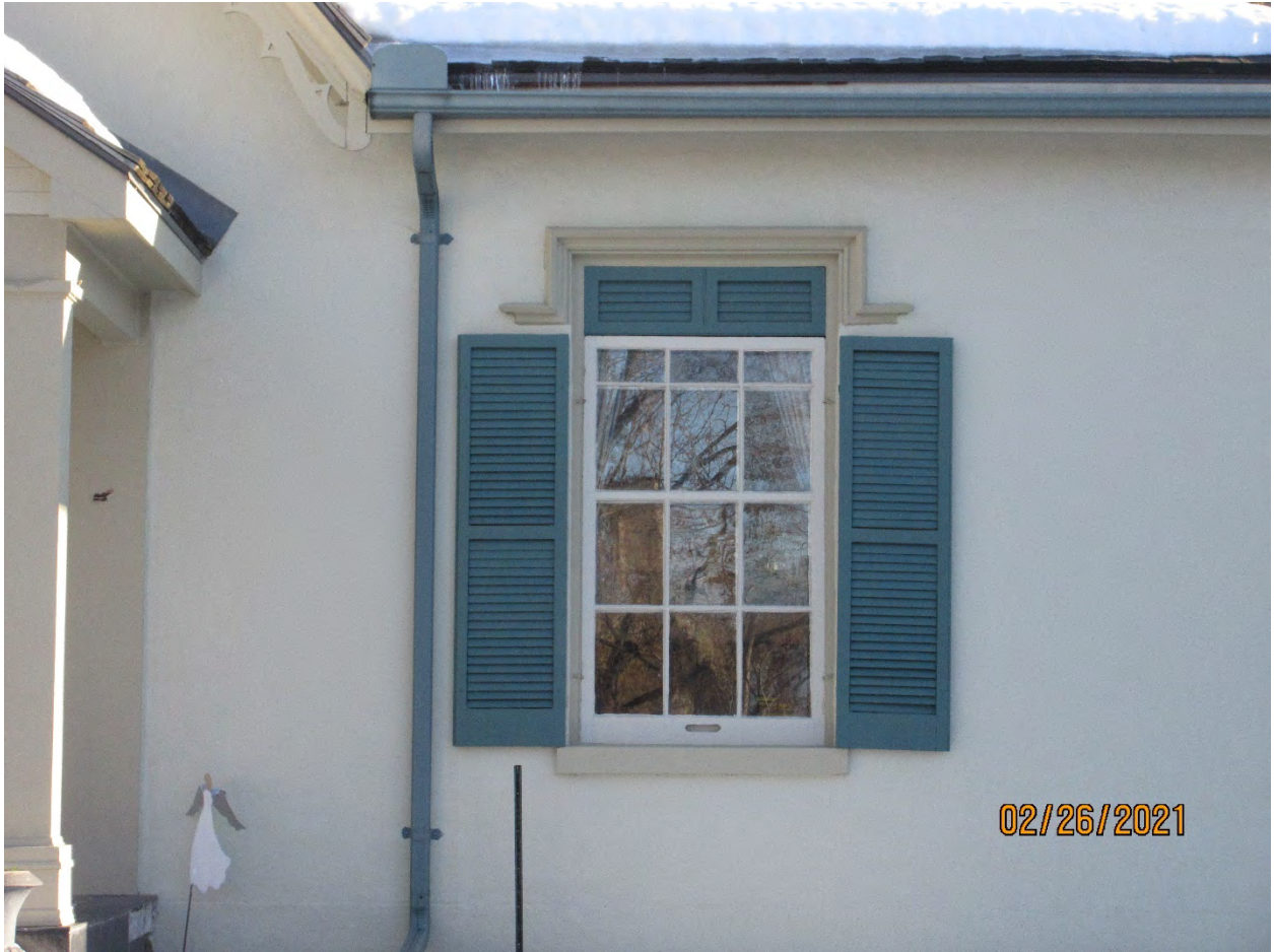
Image 17: Photograph showing the westerly front window, storm window, wood shutters, label, and sill of the front (north) façade of Carfrae Cottage.