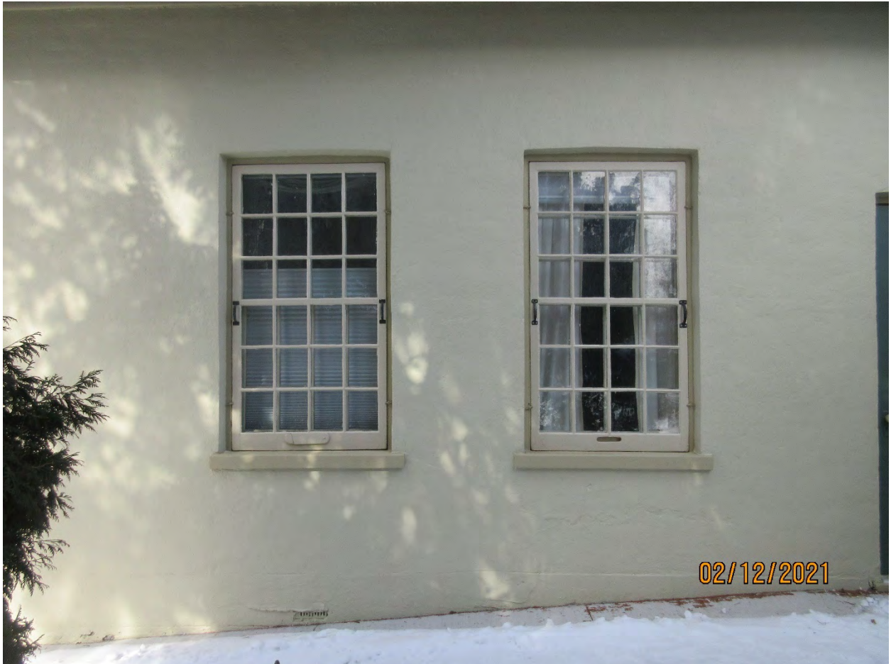
Image 23: Photograph showing the two twelve-over-twelve painted wood windows with storm windows and wooden sills on the south façade of Carfrae Cottage.