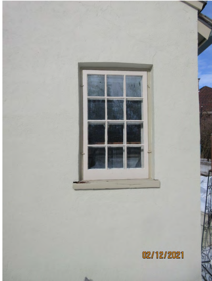
Image 29: Photograph of the six-over-six painted wood window on the south façade of the kitchen wing with a matching wood storm window and wood sill.