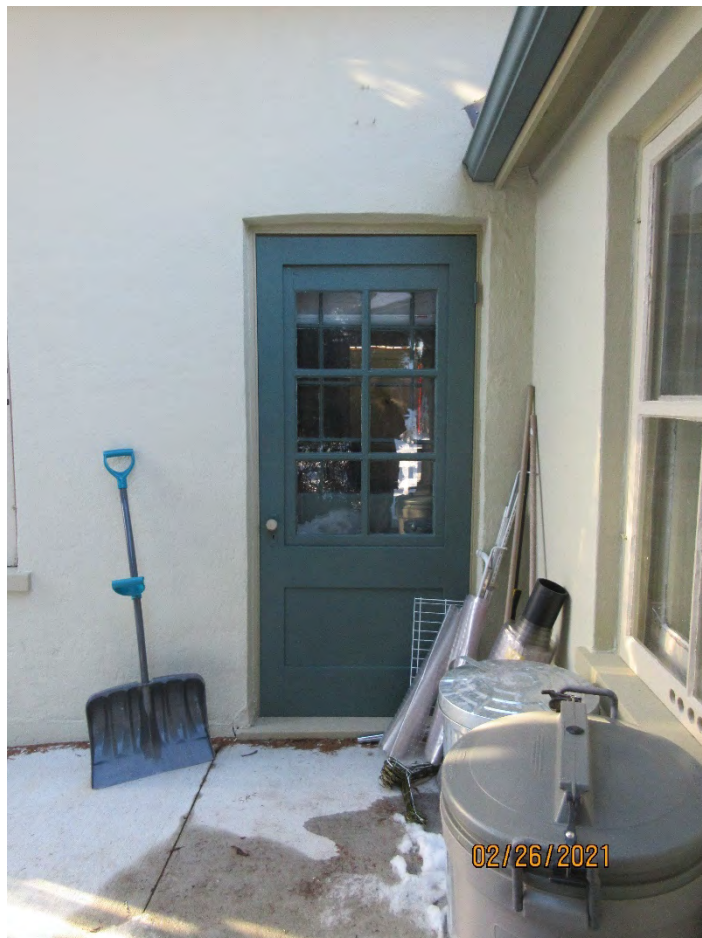
Image 24: Photograph showing the doorway, with door and storm door, on the south façade of Carfrae Cottage leading into the dining room.