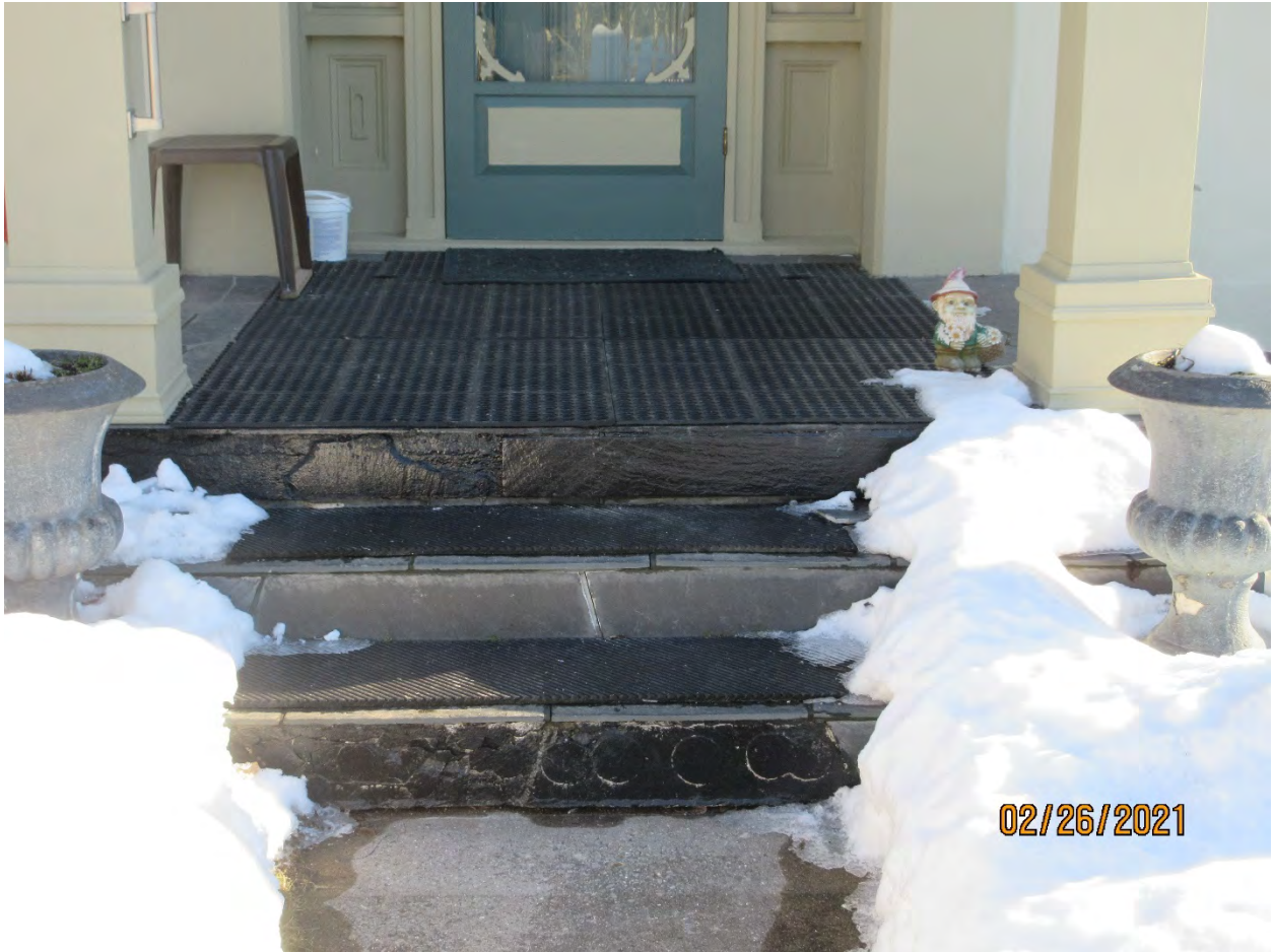
Image 15: Photograph showing the existing condition of the porch base.