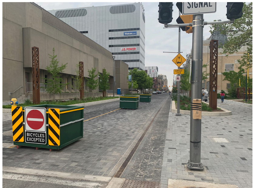
West Entrance (Dundas at Rideout)