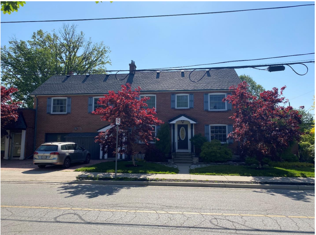
Image 2: Photograph looking west across Cathcart Street showing part of the front façade of the existing house on the subject property.