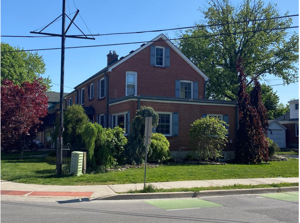
Image 1: Photograph looking southwest showing the corner of the existing house on the subject property at the corner of Cathcart and Bruce Streets within the Wortley Village-Old South Heritage Conservation District.