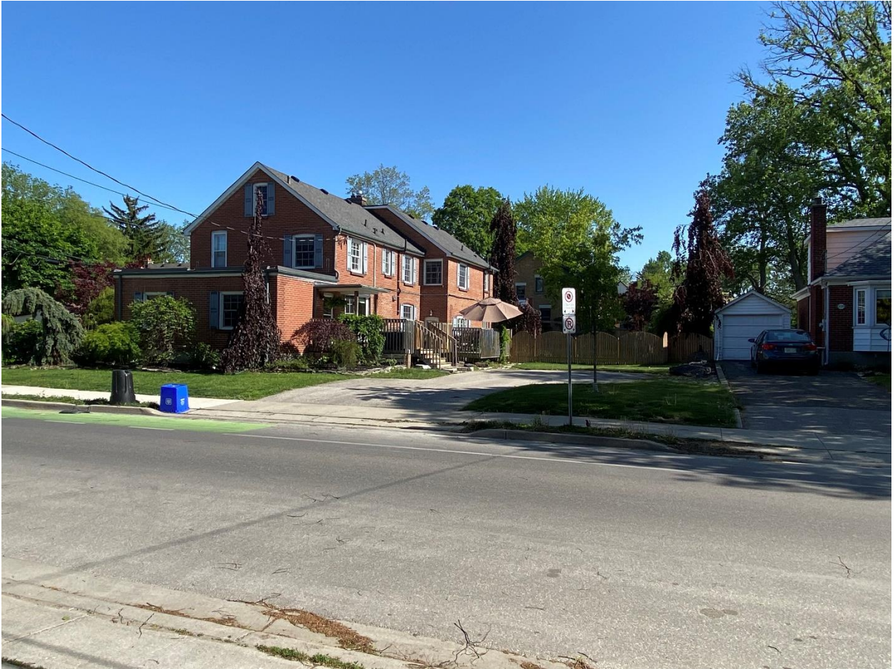
Image 4: Photograph looking south across Bruce Street showing the corner of subject property and rear the existing house where one of the new houses is proposed.