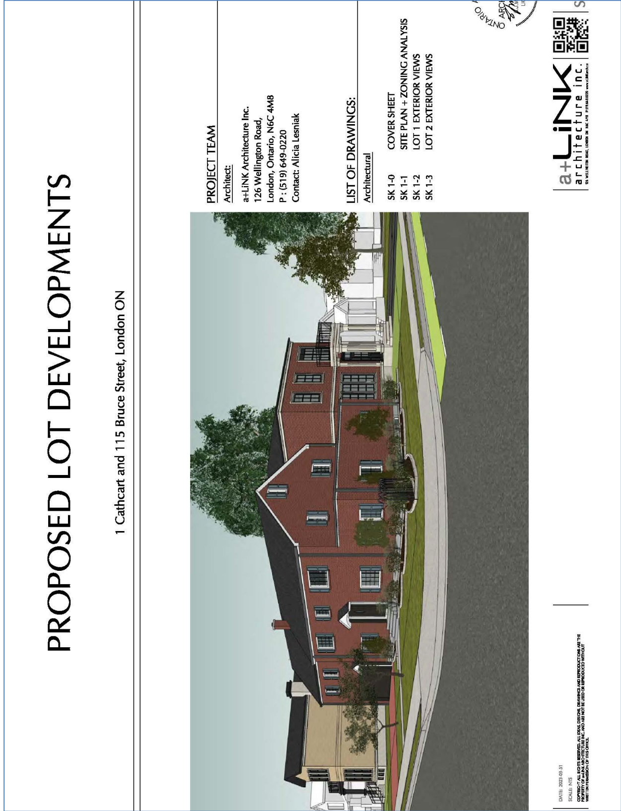
Figure 2: Drawing package submitted with the Heritage Alteration Permit application for the subject property at 1 Cathcart and 115 Bruce Streets. The above rendering illustrates an oblique side view of the proposed new house on Lot 3-Cathcart Street, along with the adjacent existing retained corner house showing alterations with removal of one-storey commercial/storage portion.