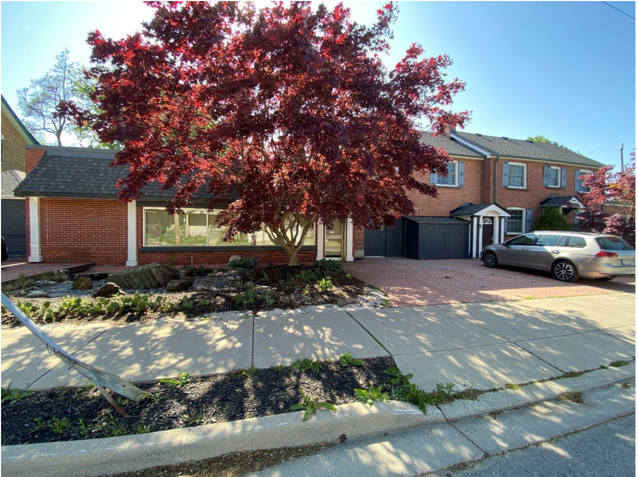
Image 3: Photograph looking west across Cathcart Street showing the full front façade of the existing house on the subject property including the one-storey commercial/storage portion to the south to be altered.