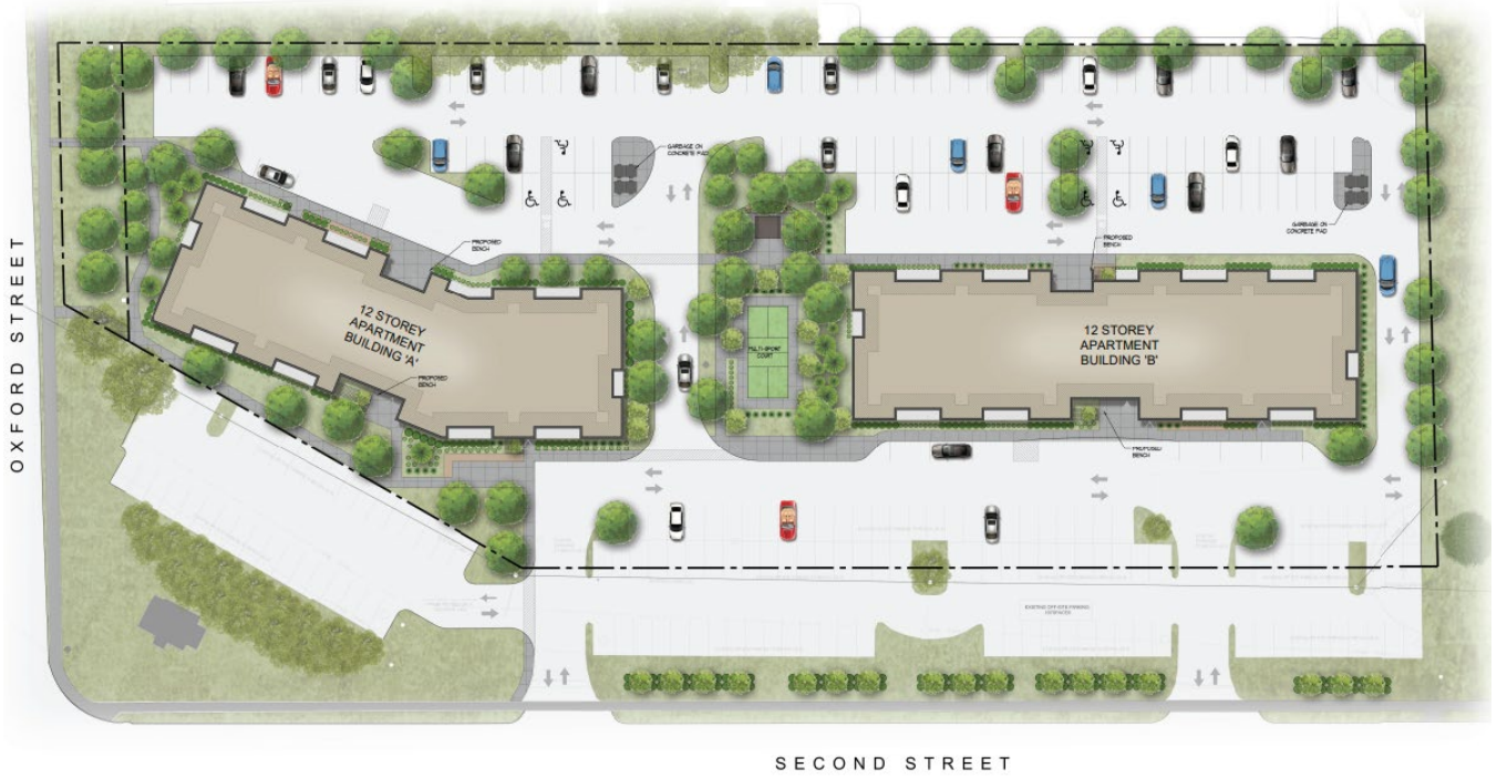
Revised landscaping site concept – May 2023