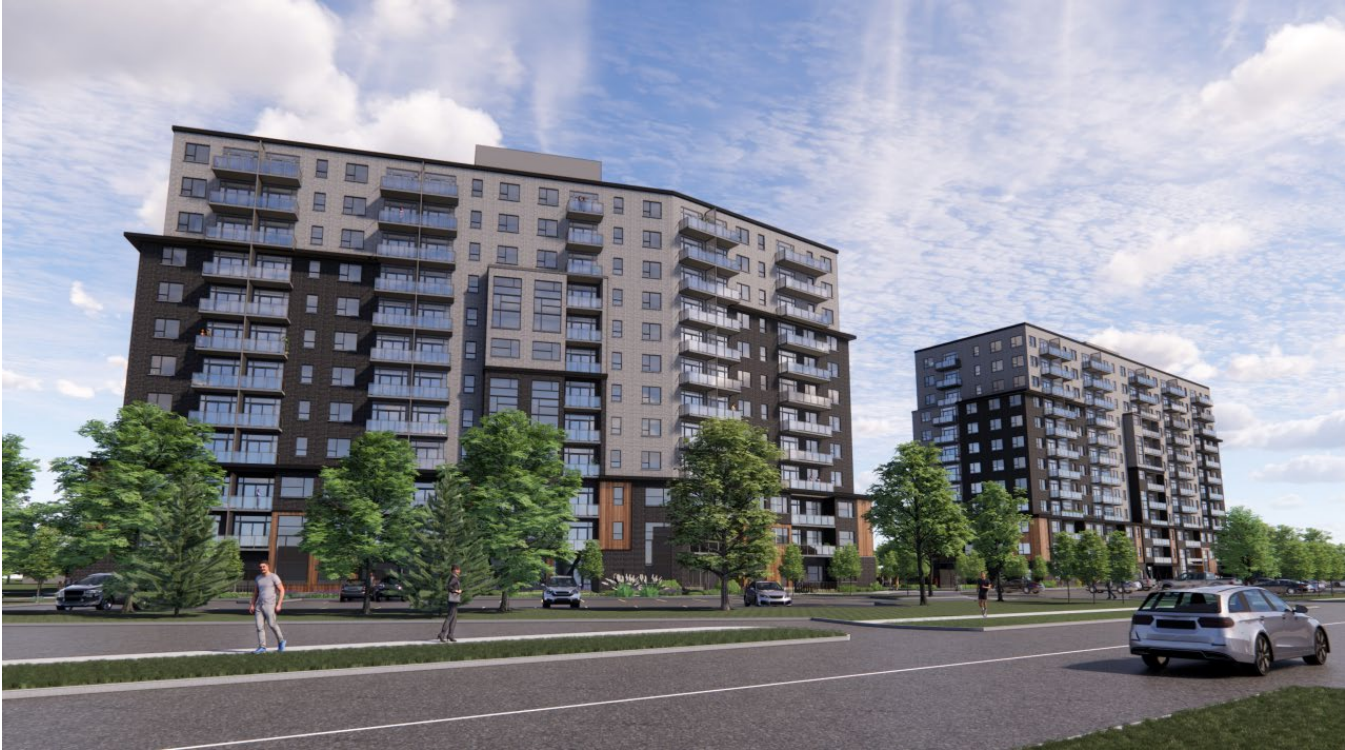
Rendering looking east from Second Street

The above images represent the applicant's proposal as submitted and may change.