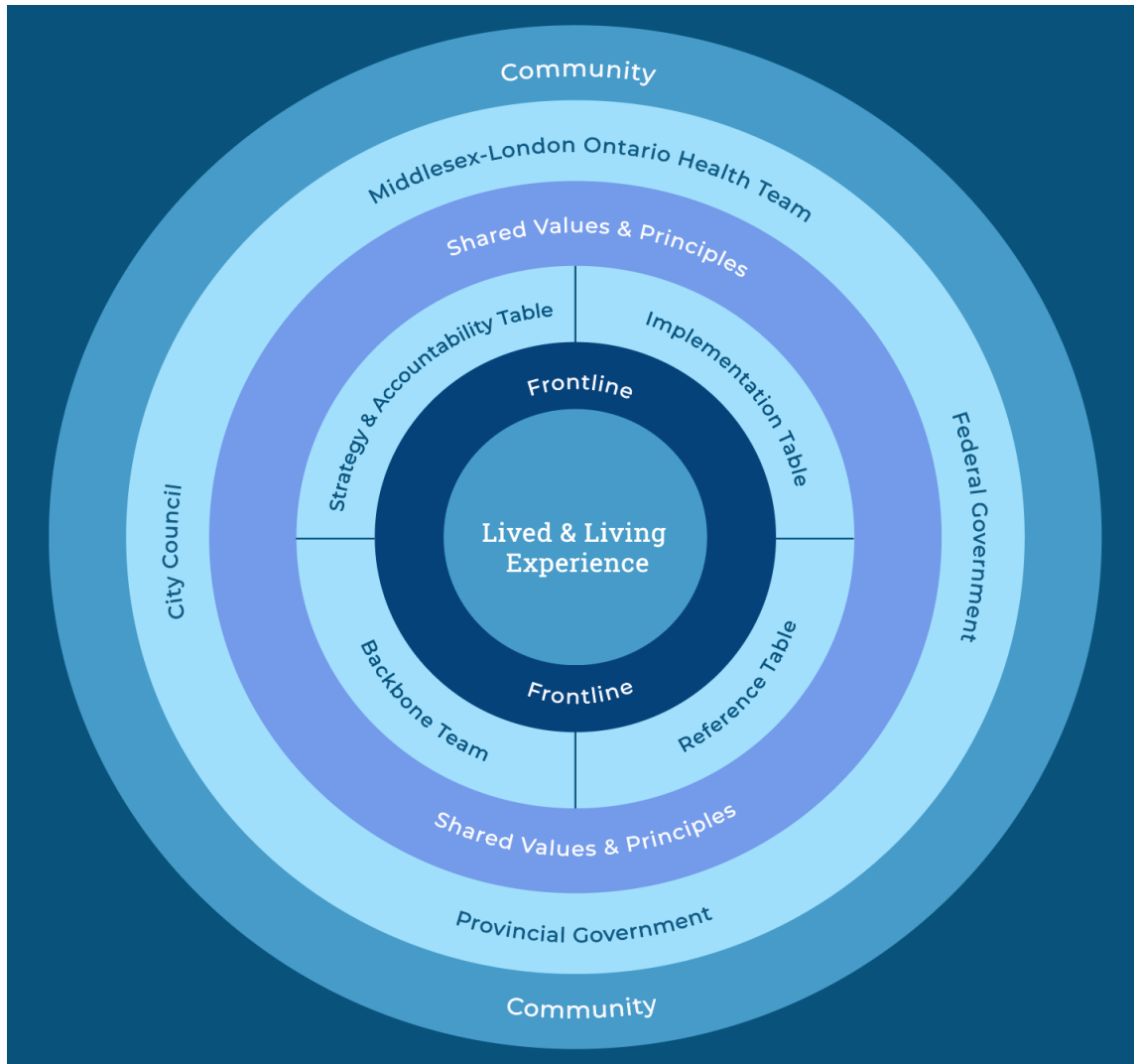
Figure 1 Implementation Framework

The implementation framework is based on collective impact, which is the commitment of a group of individuals and organizations from different sectors to a common agenda for solving a complex social problem. To create lasting solutions on a large scale, organizations from all sectors coordinate their efforts and work around a clearly defined goal. In this case, it is the implementation of the whole of community system response.