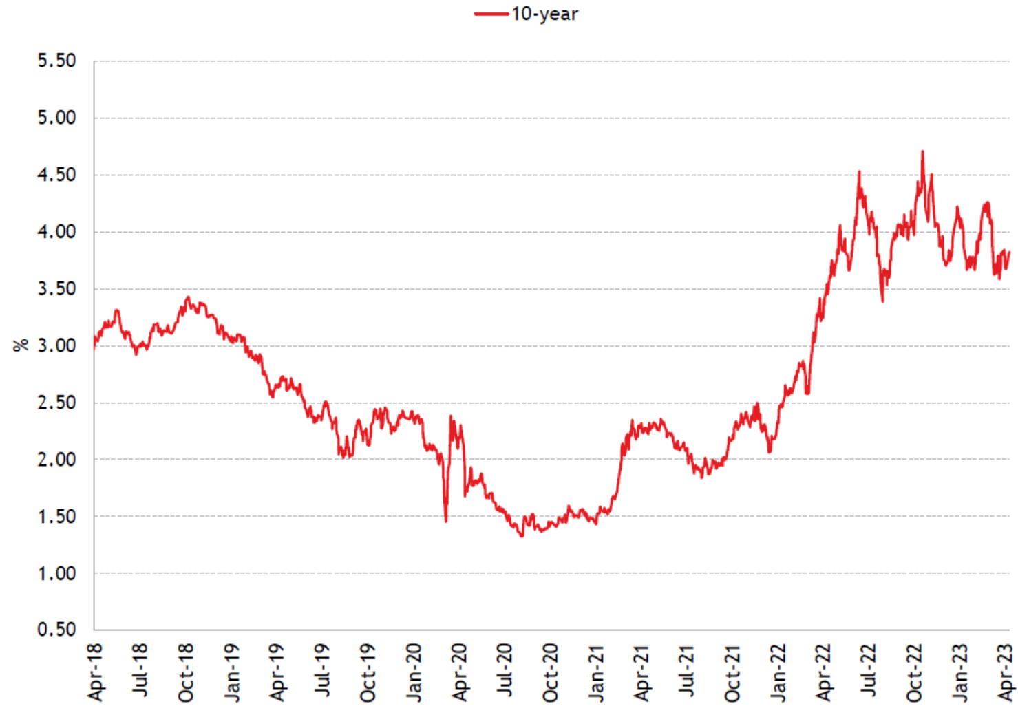
HISTORIC NEW ISSUE YIELD LEVELS FOR A TYPICAL 10-YR ONTARIO MUNICIPAL DEBENTURE