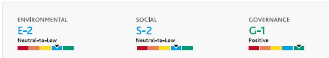
Exhibit 4 ESG Issuer Profile Scores

London's neutral-to-low ( CIS-2 ) ESG Credit Impact Score reflects neutral-to-low exposure to environmental and social risk, along with very strong governance and policy effectiveness that mitigates the city's susceptibility to these risks.