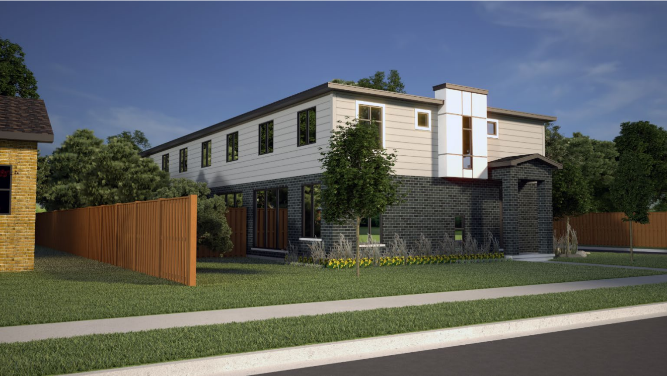
Rear View of Proposal from Wethered Street