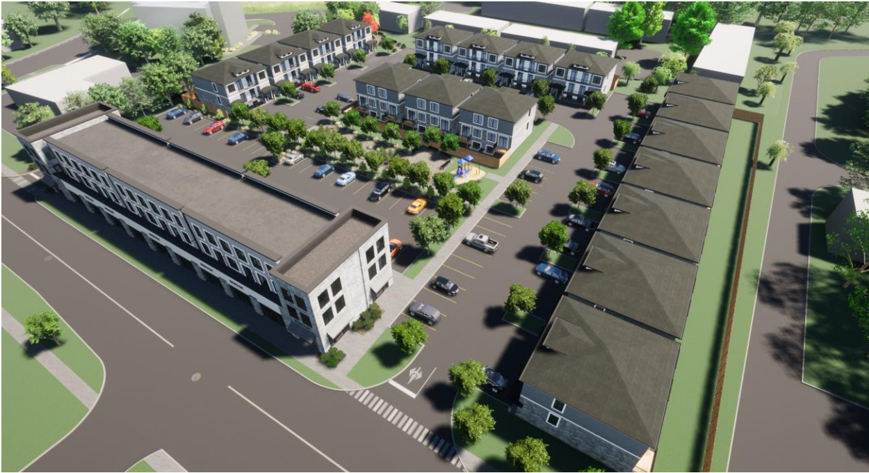
Aerial view from King Edward Avenue looking north