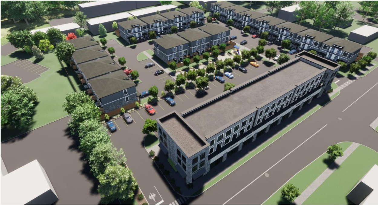
Aerial view from King Edward Avenue looking south

The above images represent the applicant's proposal as submitted and may change.