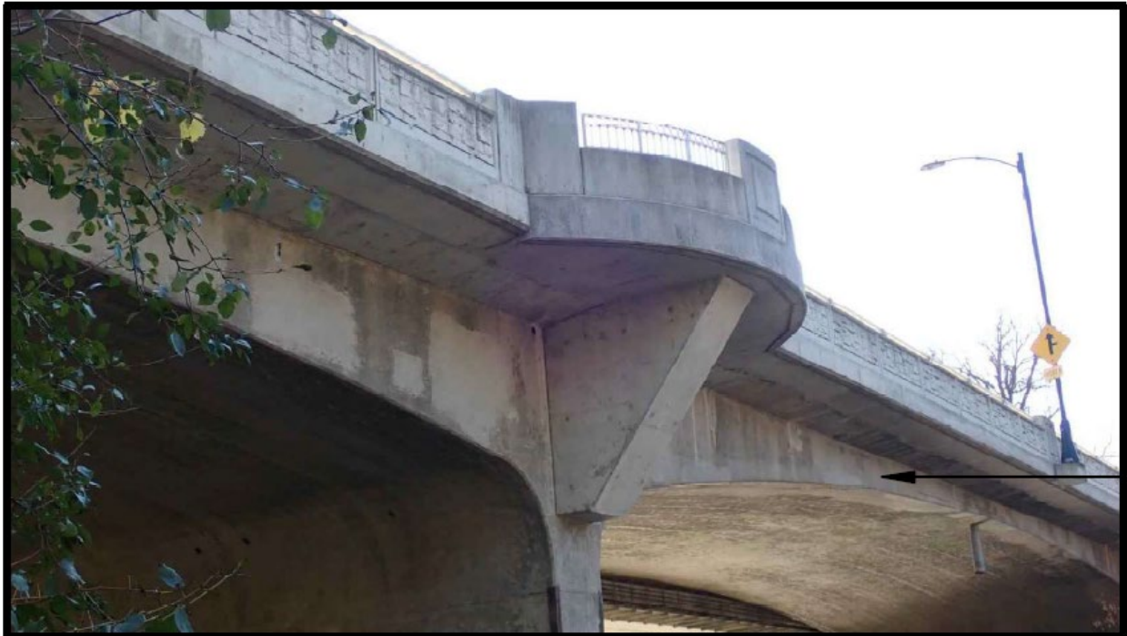
Figure 1: Area of unsound/ delaminated concrete on soffit and fascia (North Side)

AECOM completed a full detailed design package for all required repairs of the Norman Bradford Bridge in 2020. To prevent falling concrete onto the new pathway, it is recommended to complete the works from the West Abutment and Pier 1 ahead of a full bridge rehab, as these works directly impact pedestrian safety. Should these works not be completed under this current contract, the pathway connection will be required to remain closed until the works can be completed after Ro-Buck's one-year warranty period expires.