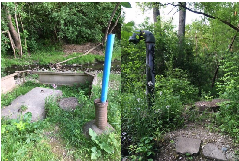
Figure 2: From left to right believed to be Chamber 12 Main and Chamber 12A.

RECOMMENDATION J : The EIS show the correct locations of each chamber.