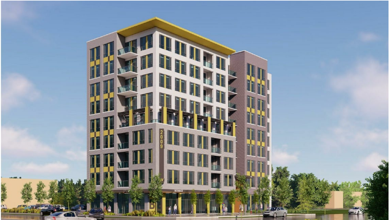
Conceptual Rendering – Northerly view from intersection of Wharncliffe Road South and Savoy Street