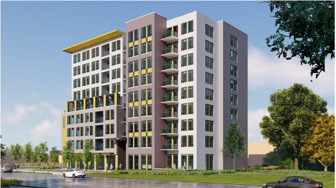
Conceptual Rendering – Southerly view from Wharncliffe Road South

The above images represent the applicant's proposal as submitted and may change.