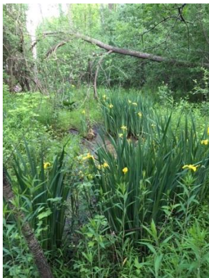
Photo of yellow irises proximal to Chamber 12A.

RECOMMENDATION L: If the invasive yellow iris cannot be removed now, its removal must be included in the work that takes place.