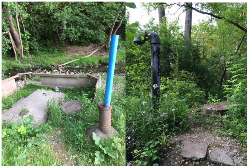
Figure 2: From left to right believed to be Chamber 12 Main and Chamber 12A.

RECOMMENDATION J : The EIS show the correct locations of each chamber.