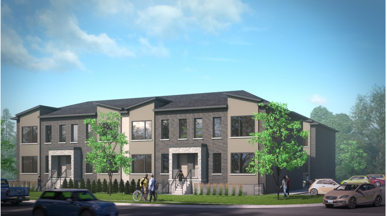
Conceptual Rendering for 536 and 542 Windermere Road

The above image represents the applicant's proposal as submitted and may change.