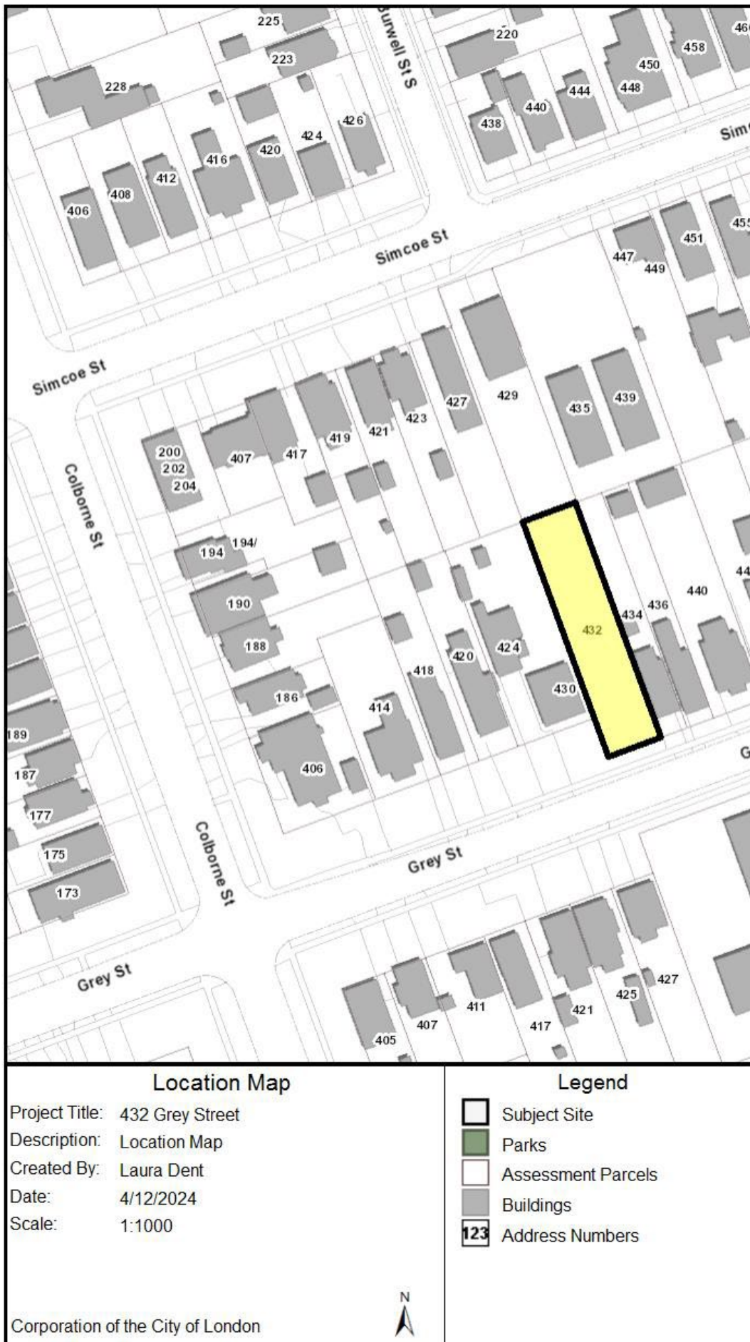
Figure 1: Map showing the location of the property at 432 Grey Street.