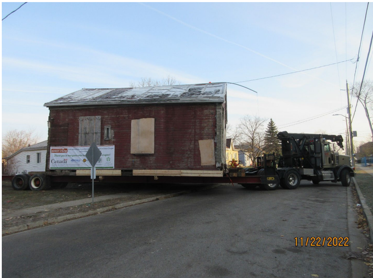
Image 2: View looking east along Grey Street, of the African Methodist Episcopal Church in transit, being moved from 432 Grey Street to Fanshawe Pioneer Village.