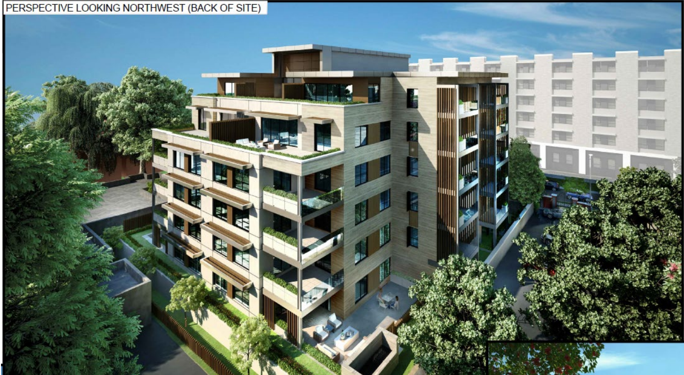
Perspective looking Northwest (Back of Site)

The above images represent the applicant's proposal as submitted and may change.