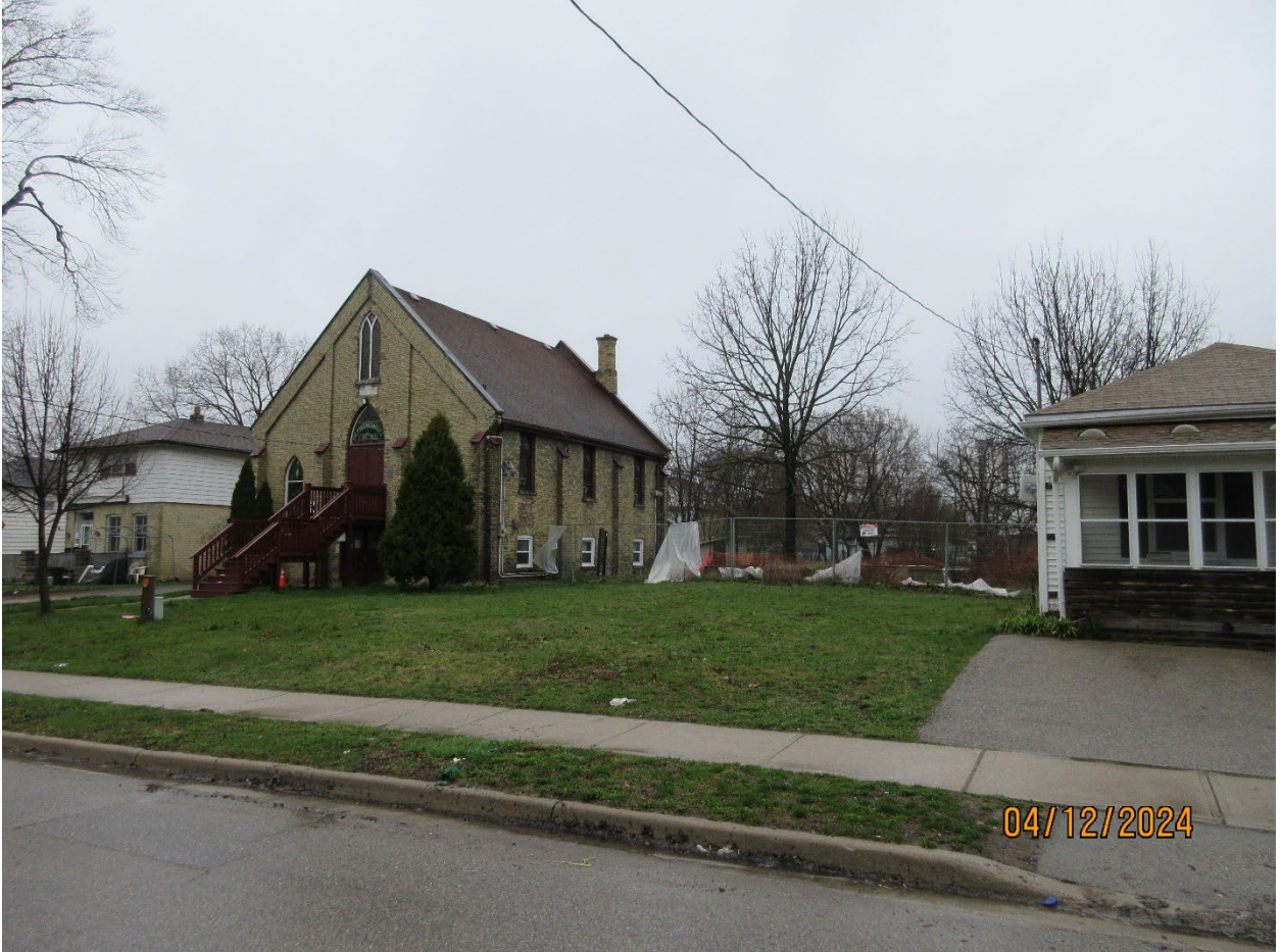
Image 4: Current view of the property at 432 Grey Street, facing north, now vacant adjacent to Beth Emanuel Church.