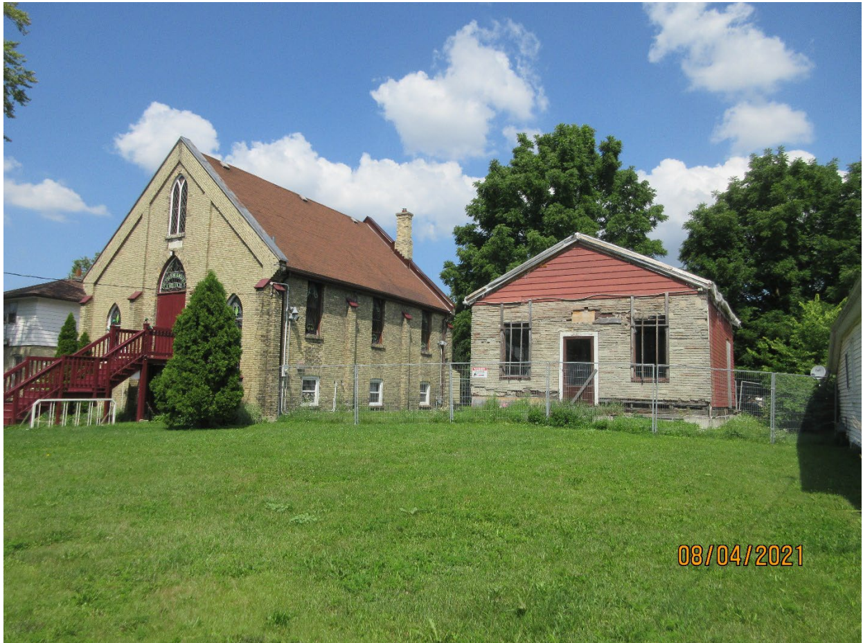
Image 1: View of the property at 432 Grey Street, facing north, with the African Methodist Episcopal Church positioned adjacent to Beth Emanuel Church.