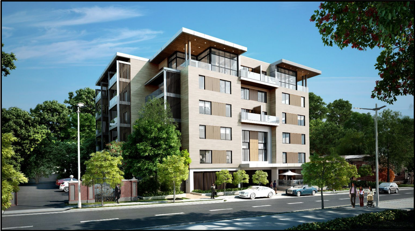
Perspective looking Southwest from College Avenue