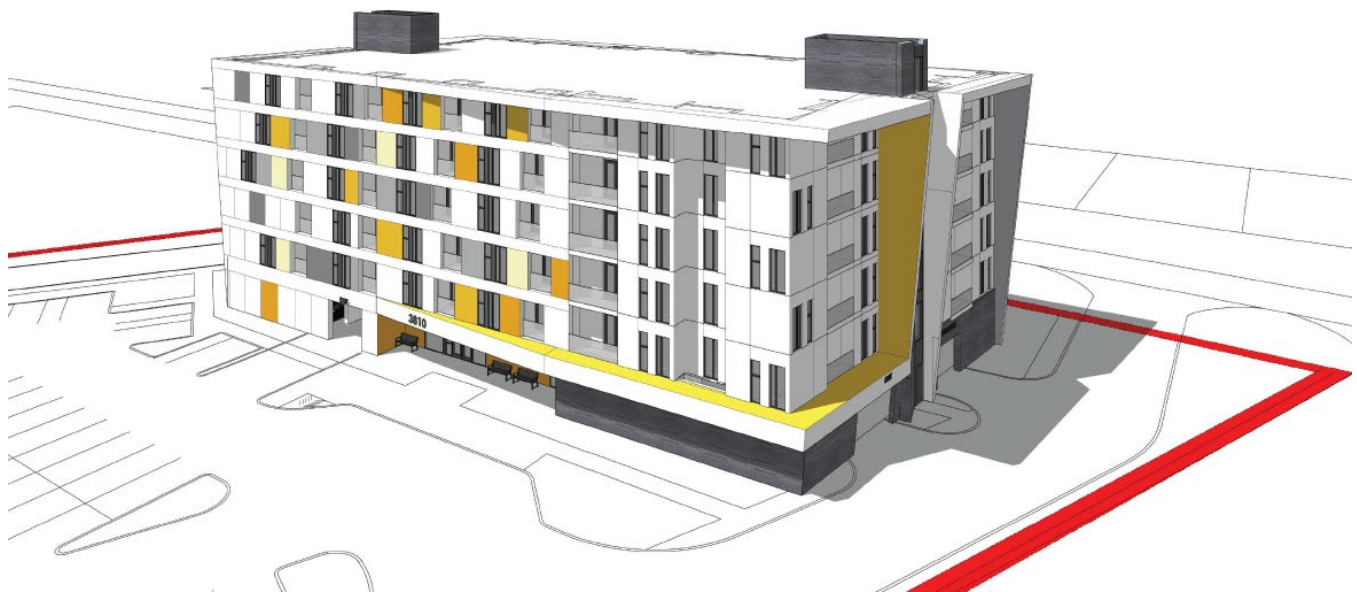
Figure 2. Rendering of Proposed Apartment Building