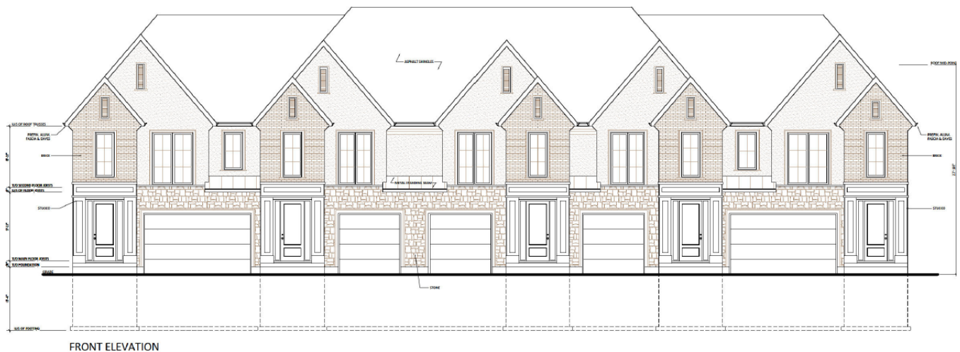
Figure 3. Elevation of Proposed Townhouses

The above images represent the applicant's proposal as submitted and may change.